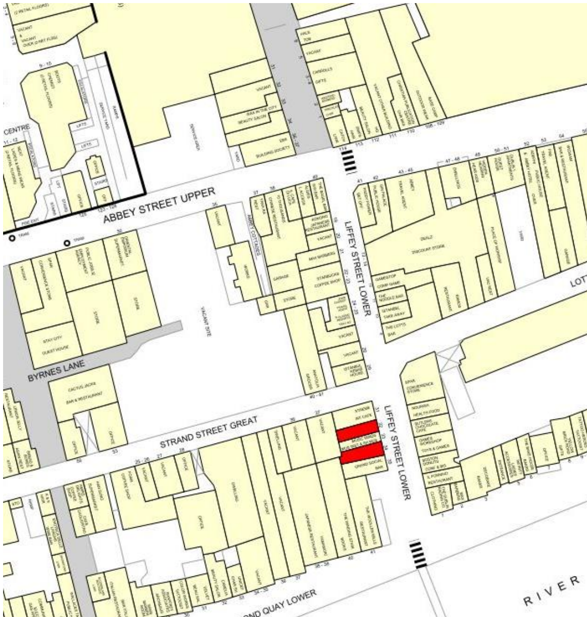
LOCATION MAP – For indicative purposes only