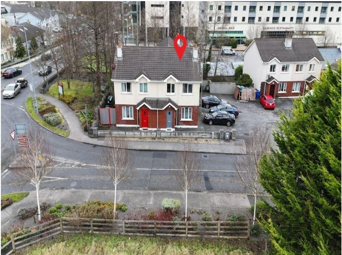
2 Dunlo Quay, Ballinasloe, H53 A033