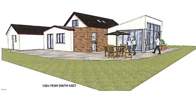
VIEW FROM SOUTH WEST