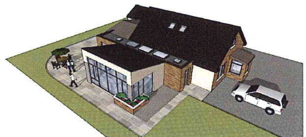
View from South West