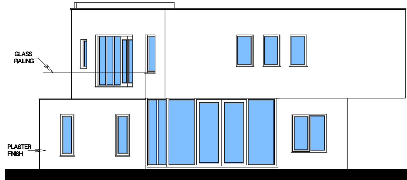
⊙ EASTERN ELEVATION (SCALE 1:100)