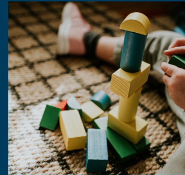
Linden Demense Crèche, Maynooth, Co. Kildare

This ground floor crèche extends to approx. 5,673 sq ft.