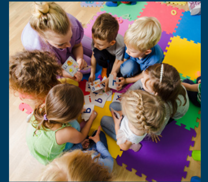
Bayly Crèche, Douglas, Co. Cork

This ground floor crèche extends to approx. 3,390 sq ft. and enjoys an extensive play area of approx. 1,000 sq ft.