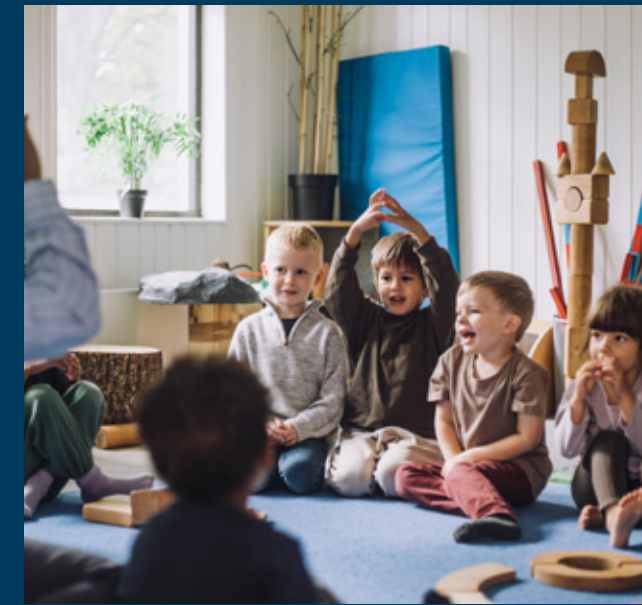
Parkside Crèche, Balgriffin, Co. Dublin

Laid out over two floors, this crèche consists of a detached unit extending to approx. 4,252 sq ft. and includes an extensive play area of 2,271 sq ft.