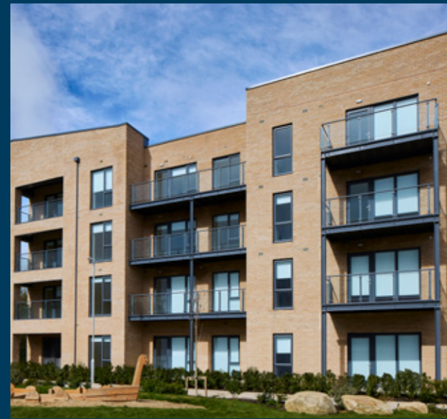
Harpur Lane Crèche, Leixlip, Co. Kildare

This ground floor crèche extends to approx. 6,562 sq ft and includes an extensive play area of 1,550 sq ft.