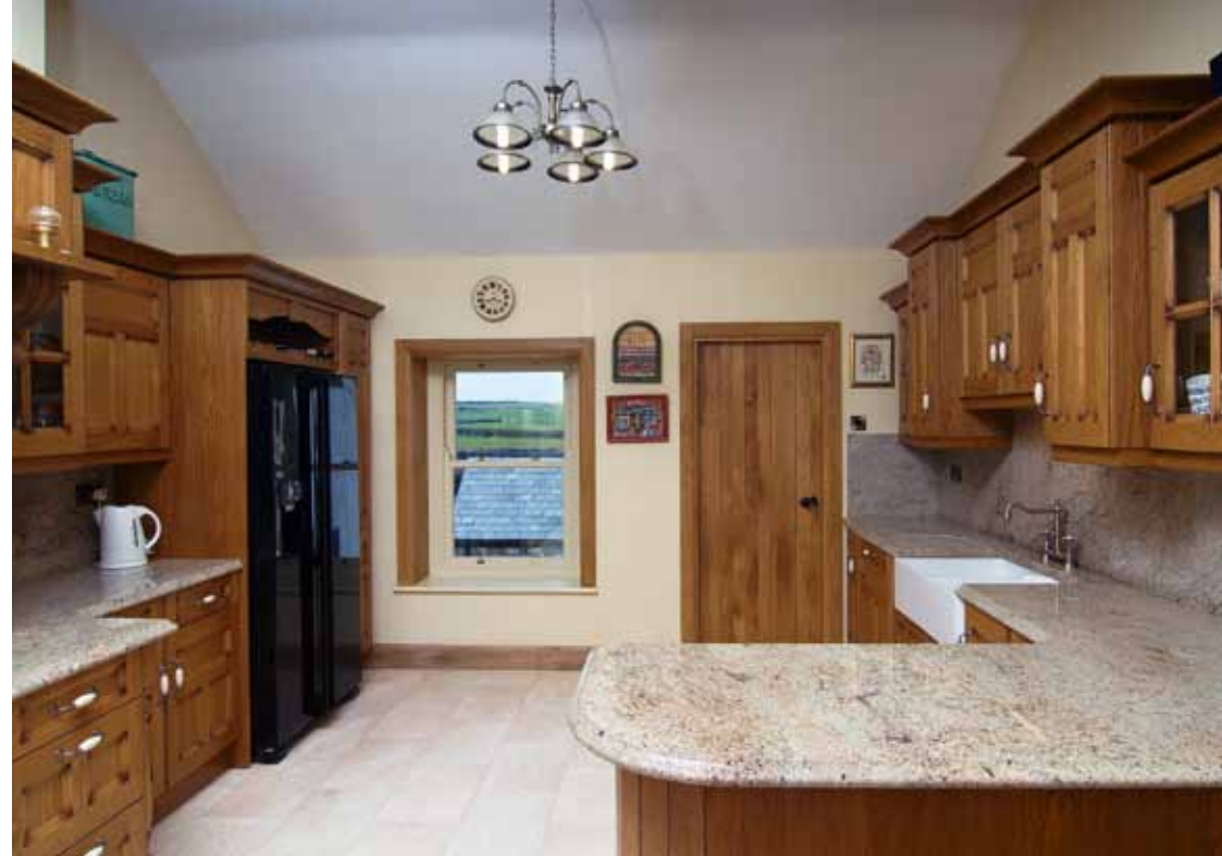
The old Coastguard Station Total Approximate Area c. 410 sq.m (4,470 sq.ft)