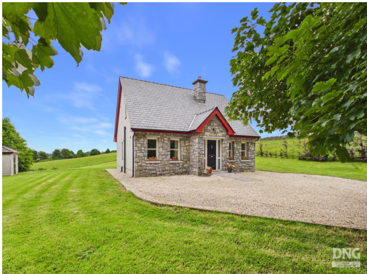
Residence On C. 12.55 Acres, Bellanacarrow, Athleague, F42 HD58