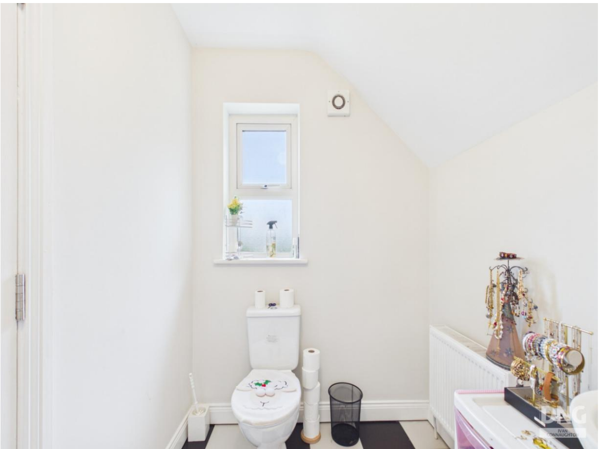
Residence On C. 12.55 Acres, Bellanacarrow, Athleague, F42 HD58