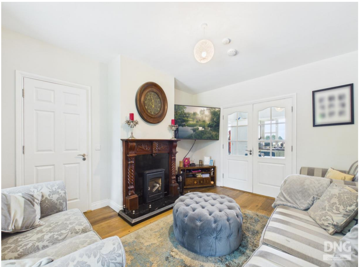
Residence On C. 12.55 Acres, Bellanacarrow, Athleague, F42 HD58