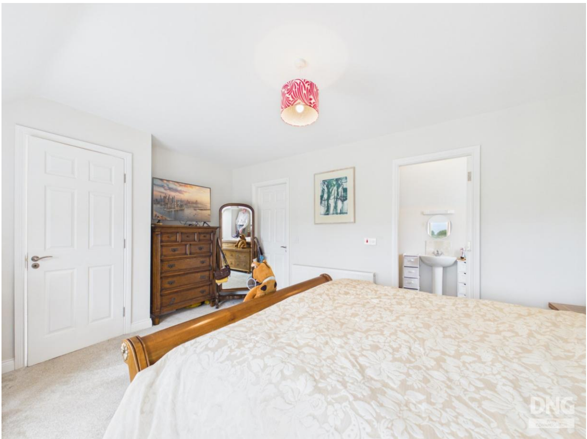
Residence On C. 12.55 Acres, Bellanacarrow, Athleague, F42 HD58