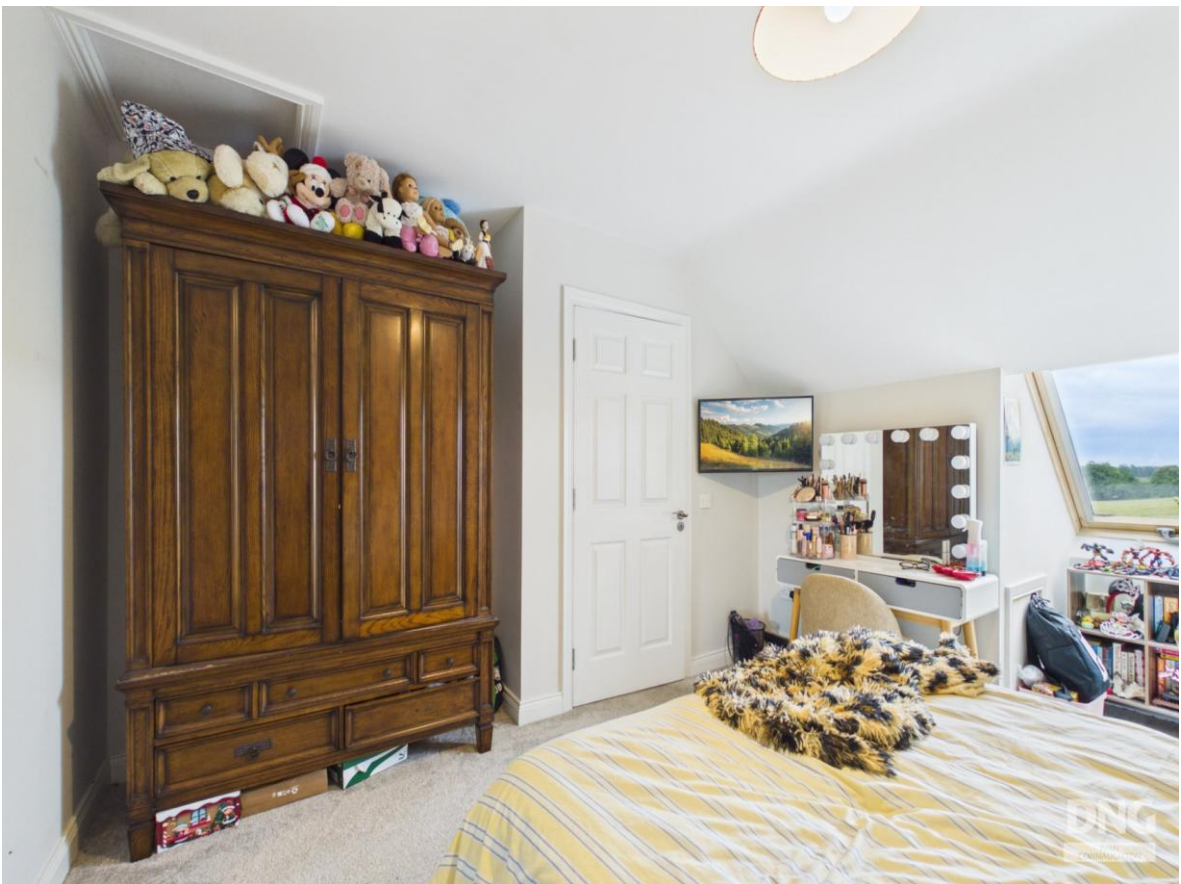
Residence On C. 12.55 Acres, Bellanacarrow, Athleague, F42 HD58