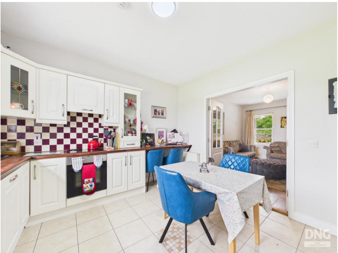
Residence On C. 12.55 Acres, Bellanacarrow, Athleague, F42 HD58