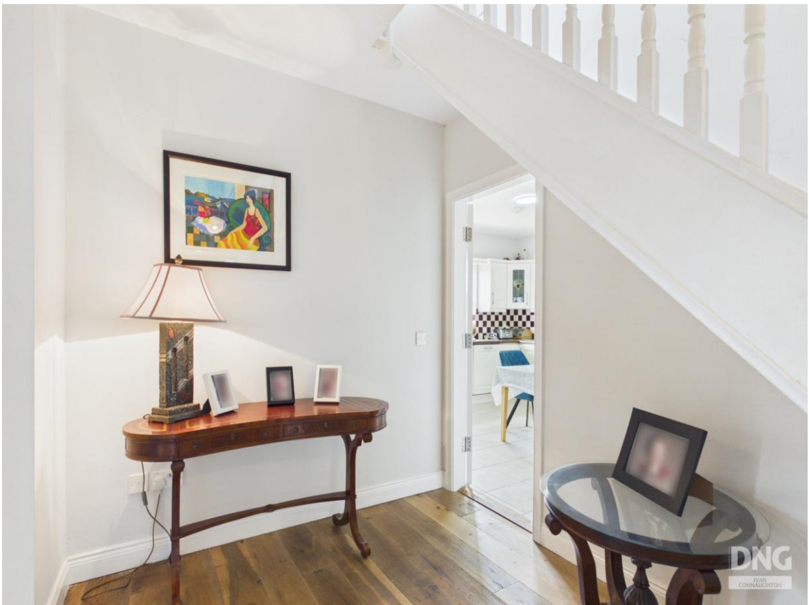
Residence On C. 12.55 Acres, Bellanacarrow, Athleague, F42 HD58