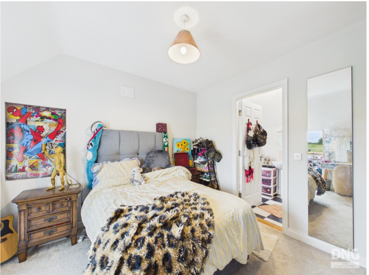
Residence On C. 12.55 Acres, Bellanacarrow, Athleague, F42 HD58