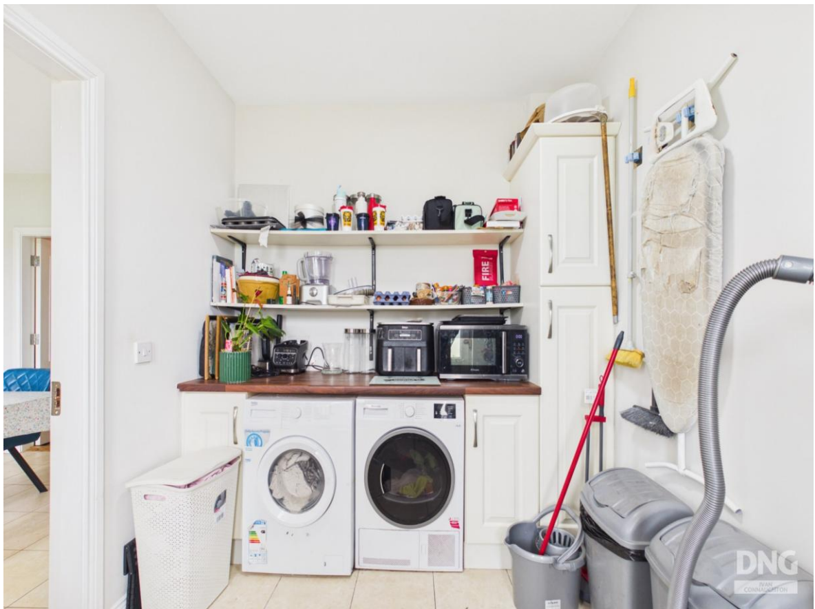
Residence On C. 12.55 Acres, Bellanacarrow, Athleague, F42 HD58