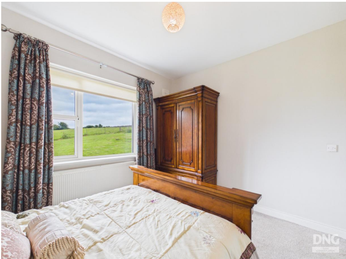
Residence On C. 12.55 Acres, Bellanacarrow, Athleague, F42 HD58