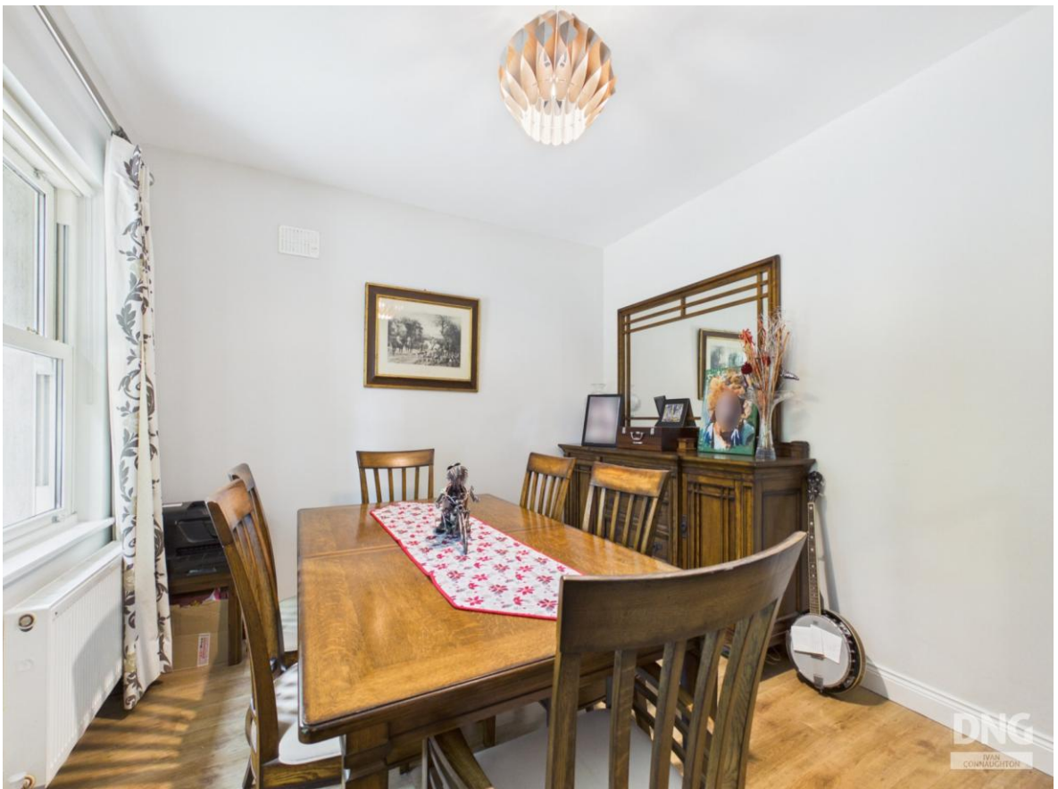
Residence On C. 12.55 Acres, Bellanacarrow, Athleague, F42 HD58