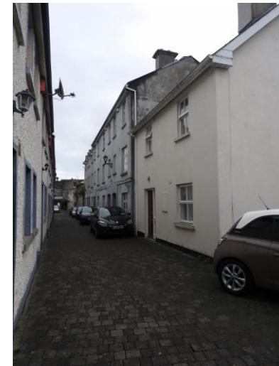
Located at the top of Colliers Lane, just off the High Street