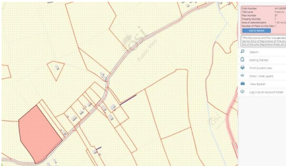
1.68 ha / 4.15 Acres