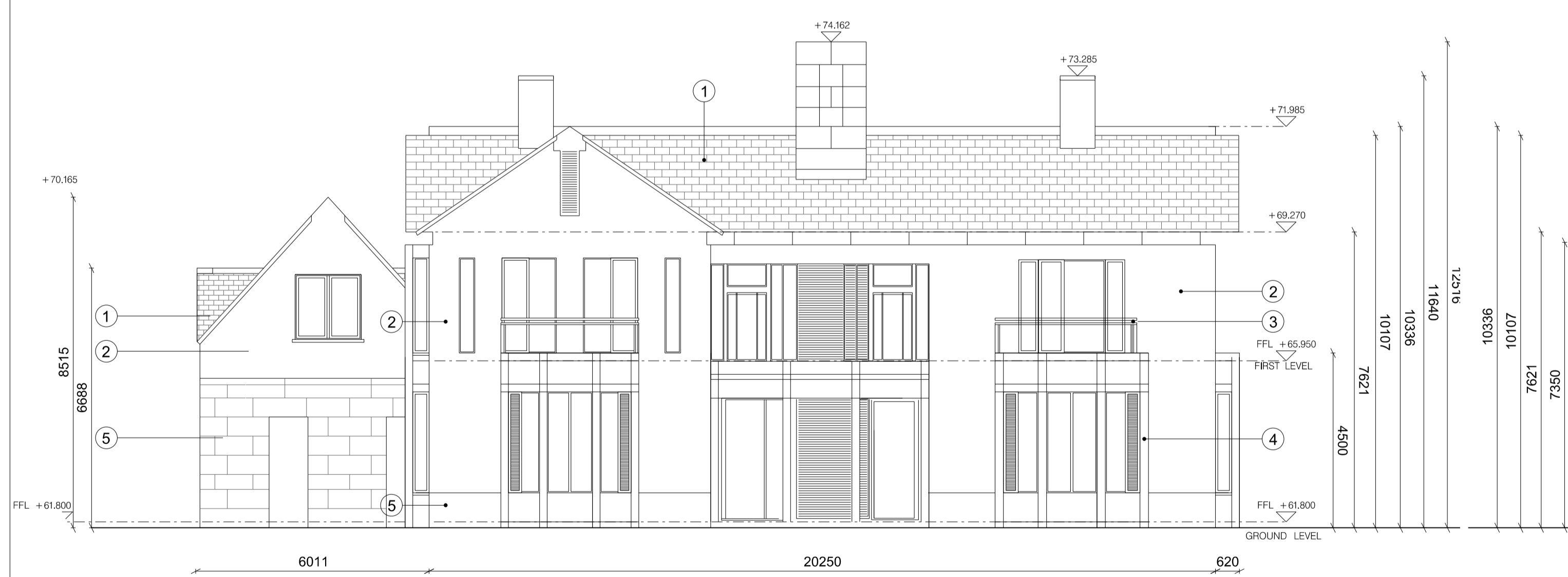
1 ELEVATION E3 1:100