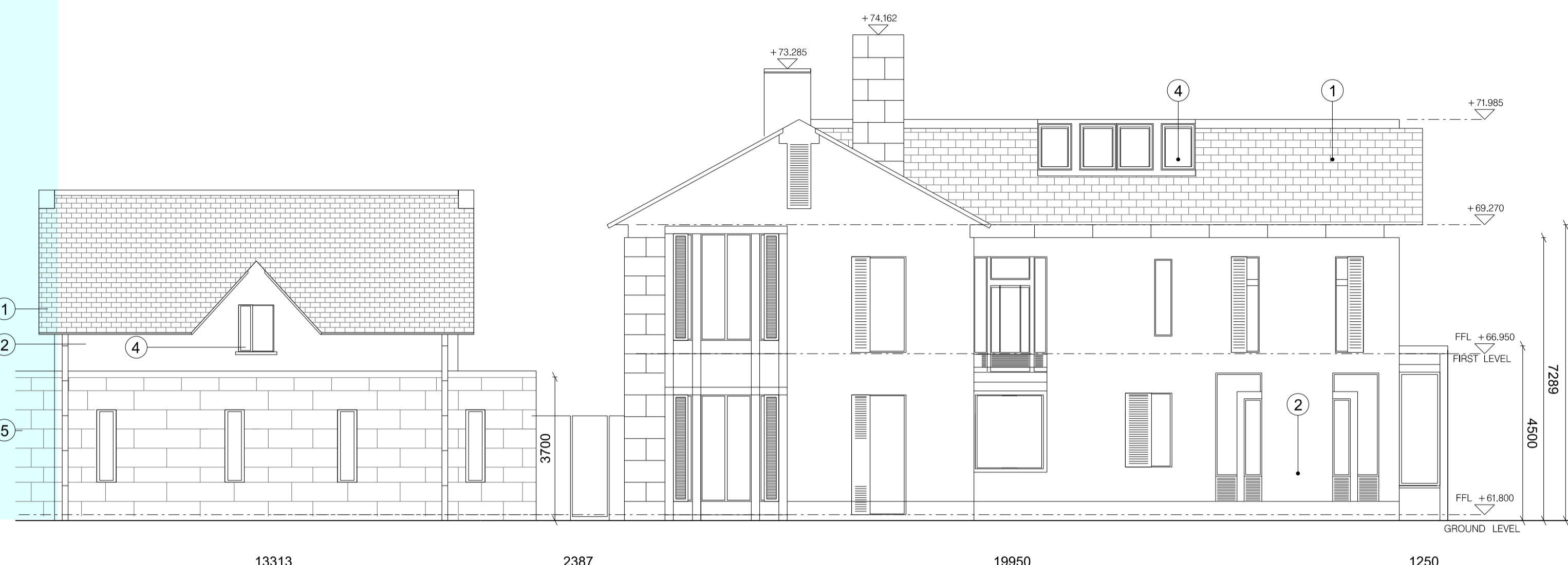
1 ELEVATION E2 1:100