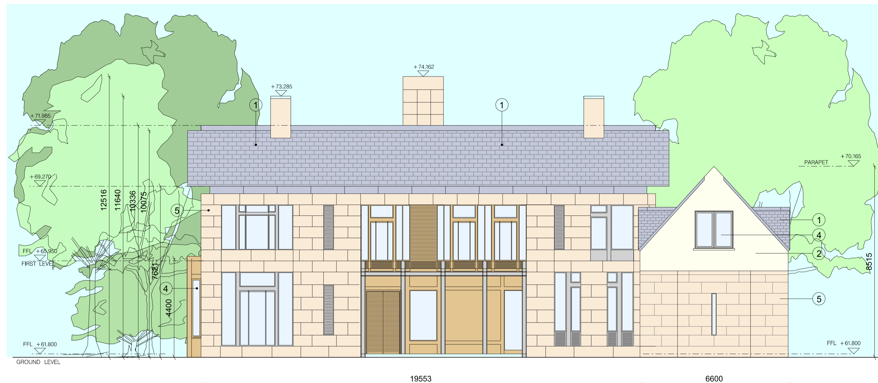
1 ELEVATION E1 1:100