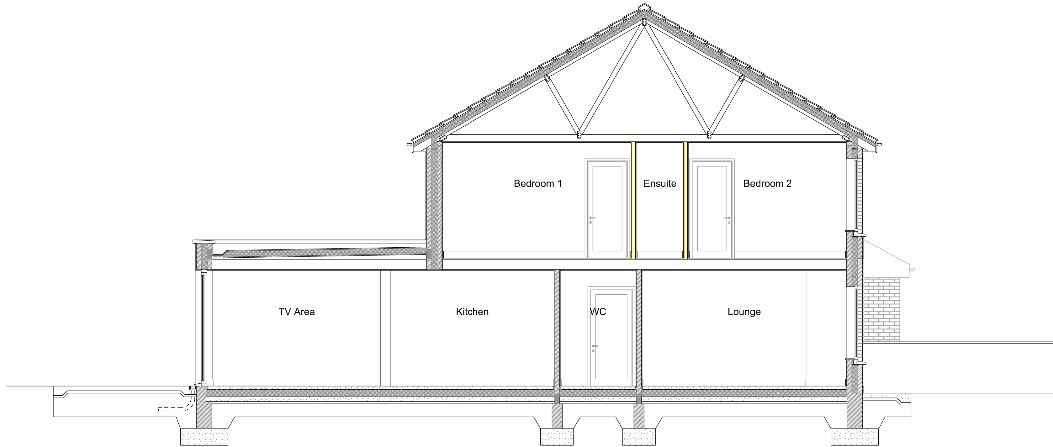
02 SECTION B-B AS PROPOSED 1:50

1. Do not use double dimensions. 2. Do not use double dimensions. 3. Do not use double dimensions. 4. Do not use double dimensions. 5. Do not use double dimensions. 6. Do not use double dimensions. 7. Do not use double dimensions. 8. Do not use double dimensions. 9. Do not use double dimensions. 10. Do not use double dimensions.