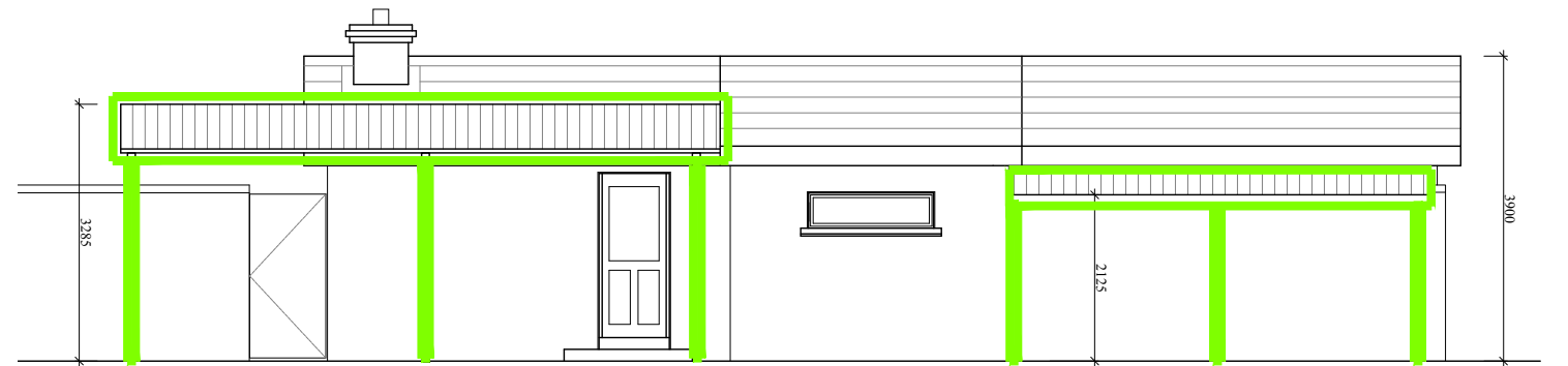
NORTH WEST ELEVATION 1:100@A3