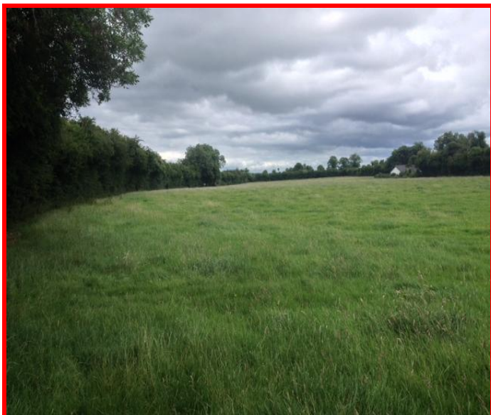
Photo of lands