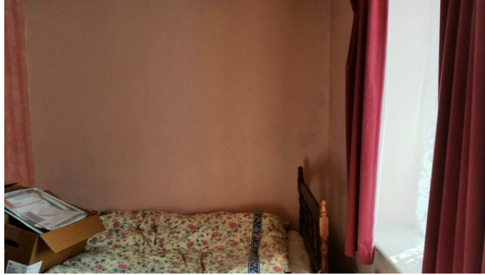
9'01 x 7'02. Carpet, light fittings, curtains and blinds.