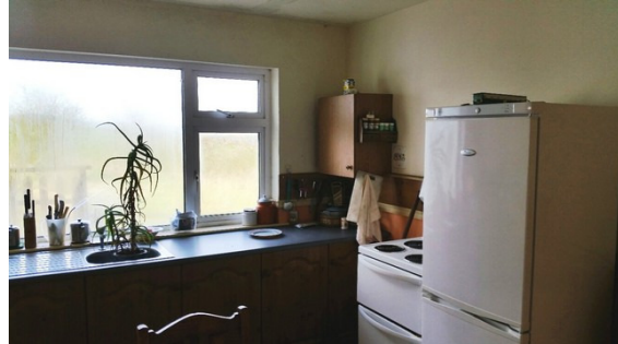
Kitchen: 10'05 x 13'03. Tiled floor, light fittings.

Utility: 6'10 x 3'10. Lino flooring, light fittings and curtains.