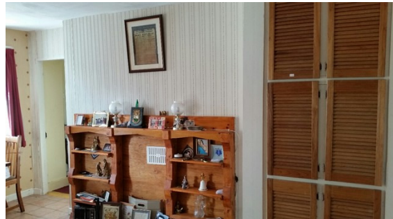
Dining Room: 15'0 x 8'04. Tiled flooring, Built-in units, light fittings and curtains,