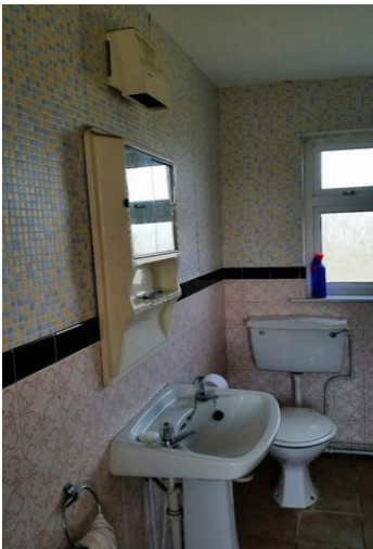
Main Bathroom: 8'07 x 5'11. Tiled floor and walls, wc, whb, electric shower, light fittings.