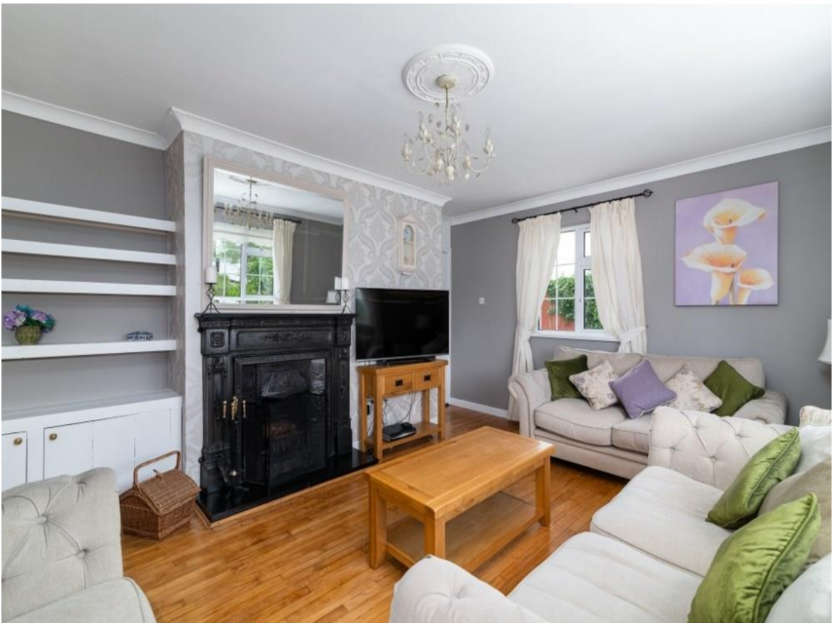
Ballincurry, Glinsk, F45 TV70