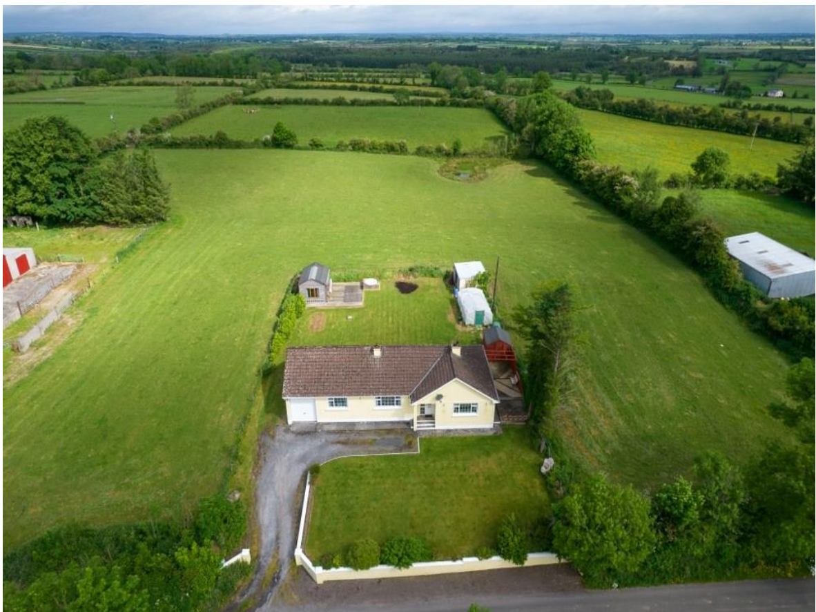
Ballincurry, Glinsk, F45 TV70