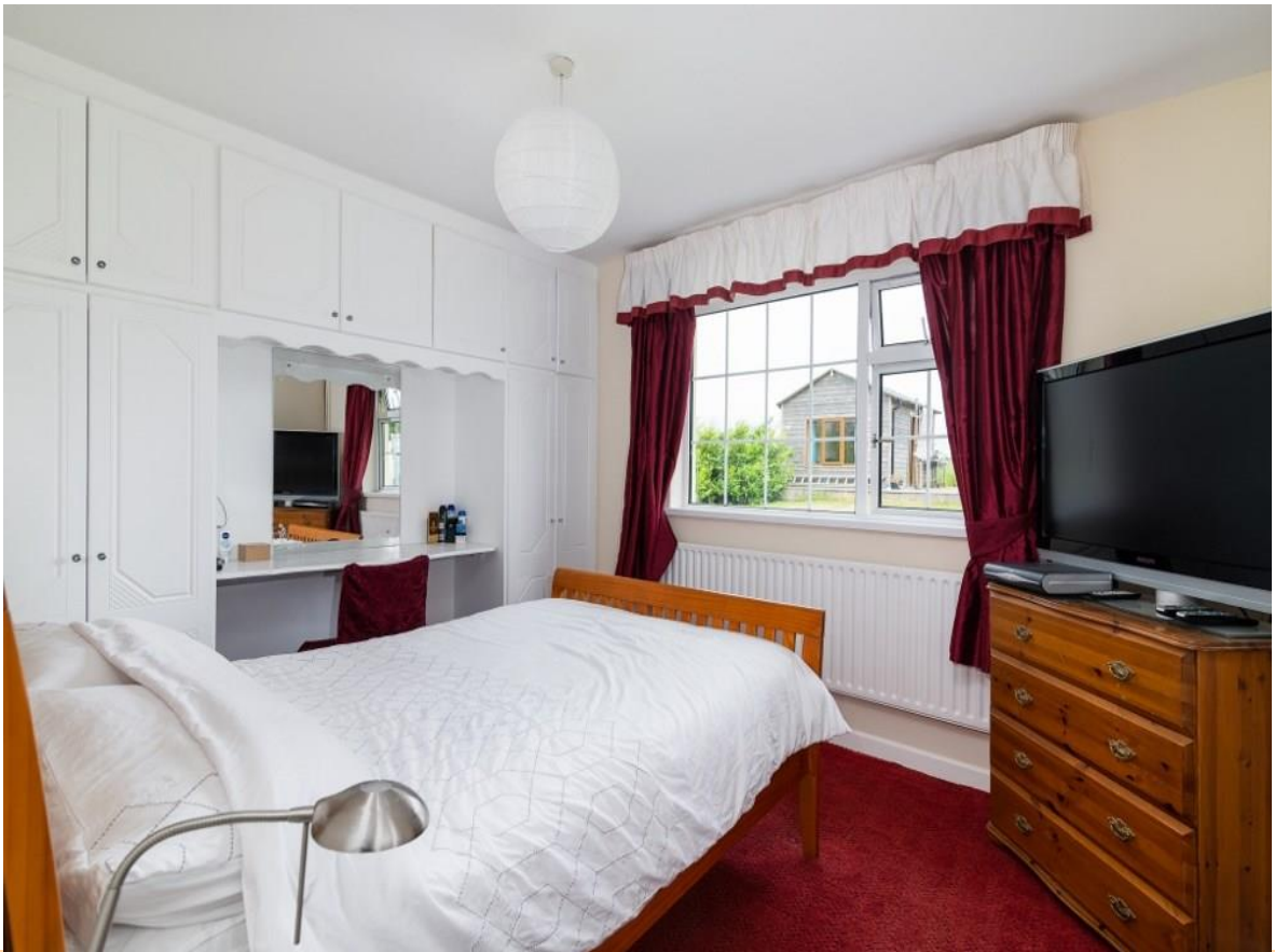
Ballincurry, Glinsk, F45 TV70