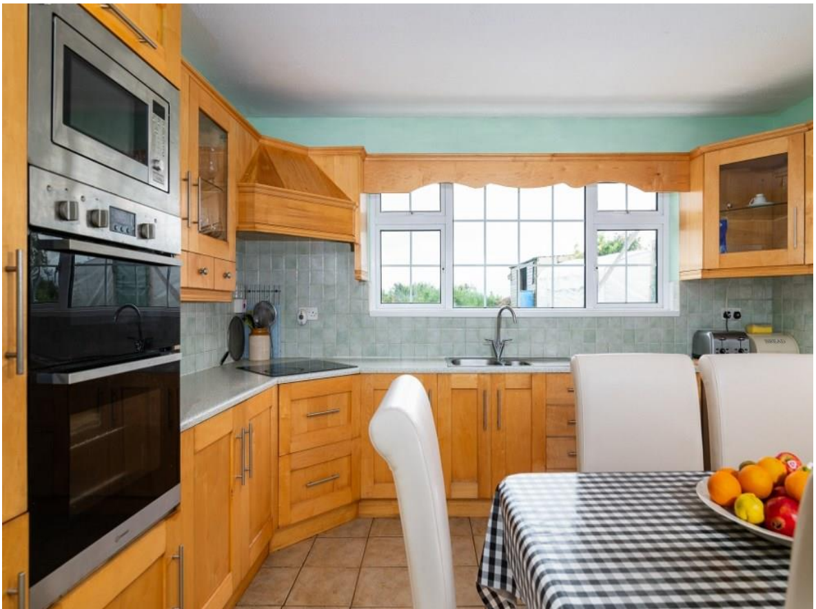
Ballincurry, Glinsk, F45 TV70