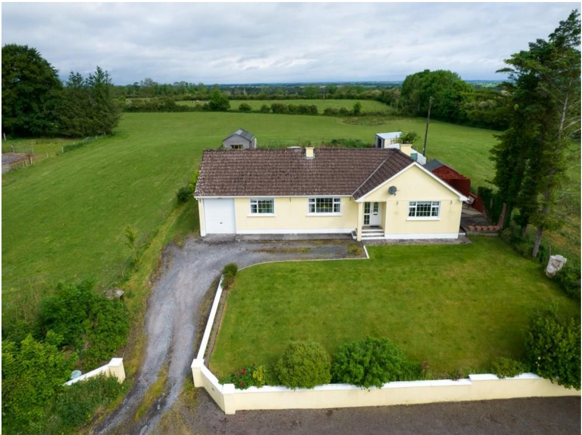
Ballincurry, Glinsk, F45 TV70