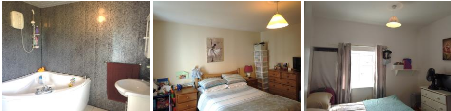
Bedrooms & Bathroom

Bathroom 9' x 8'3 (2.7 x 2.5) Tiled flooring, WH, WC and Corner Bath with Mira Elite shower overhead