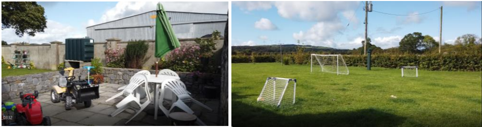
Patio Area to side with garden to rear

OUT-BUILDINGS : Walled in yard with 4 stone buildings / stables and a 6 span hay barn with a 22ft lean-to to one side and a 30ft lean-to to the other side, walled in yard to the other side of the haybarn with cattle crush facilities and collecting pen in the field opposite the farmyard.