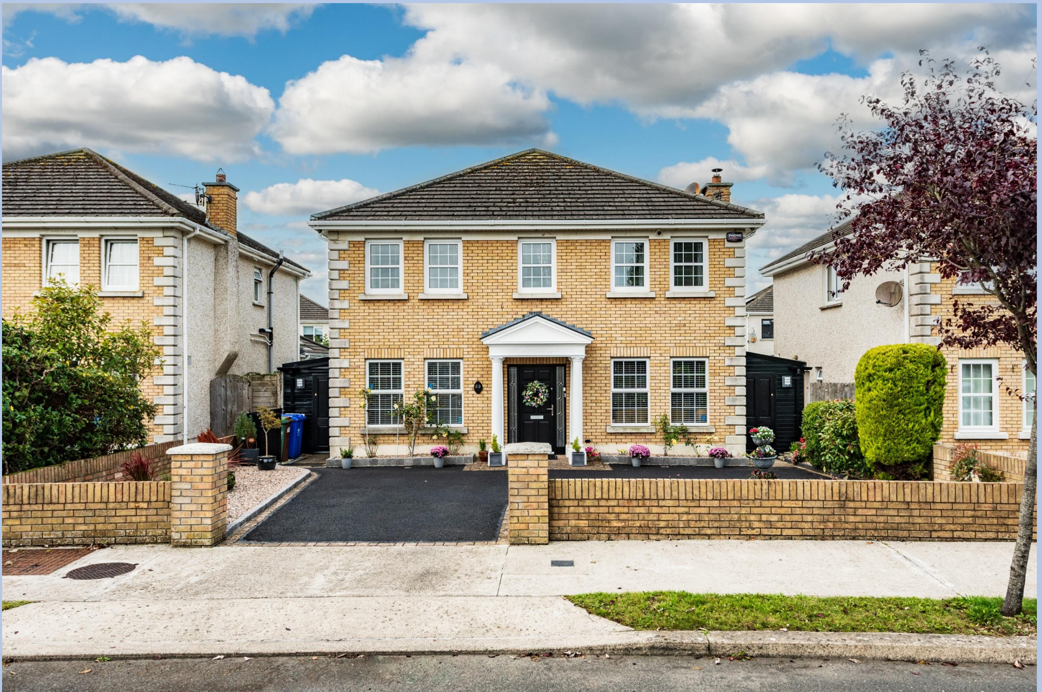
69 Wellesley Manor, Newbridge, Co. Kildare, W12 DP94.