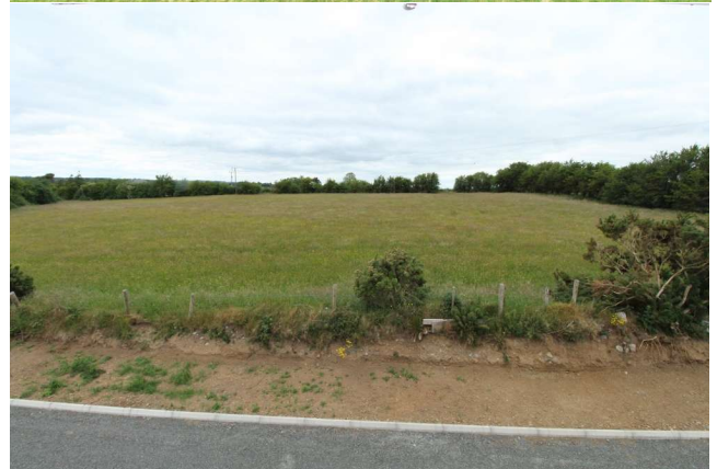
New Five Bedroom Residence At, Lissaneaville, Roscommon, F42 XE61