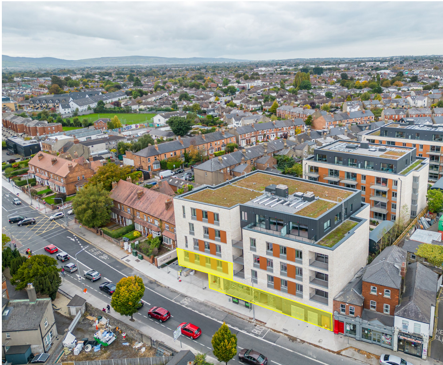
(For illustrative purposes only)