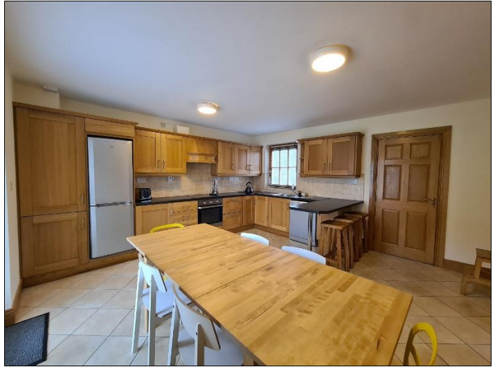
Kitchen / Dining Room