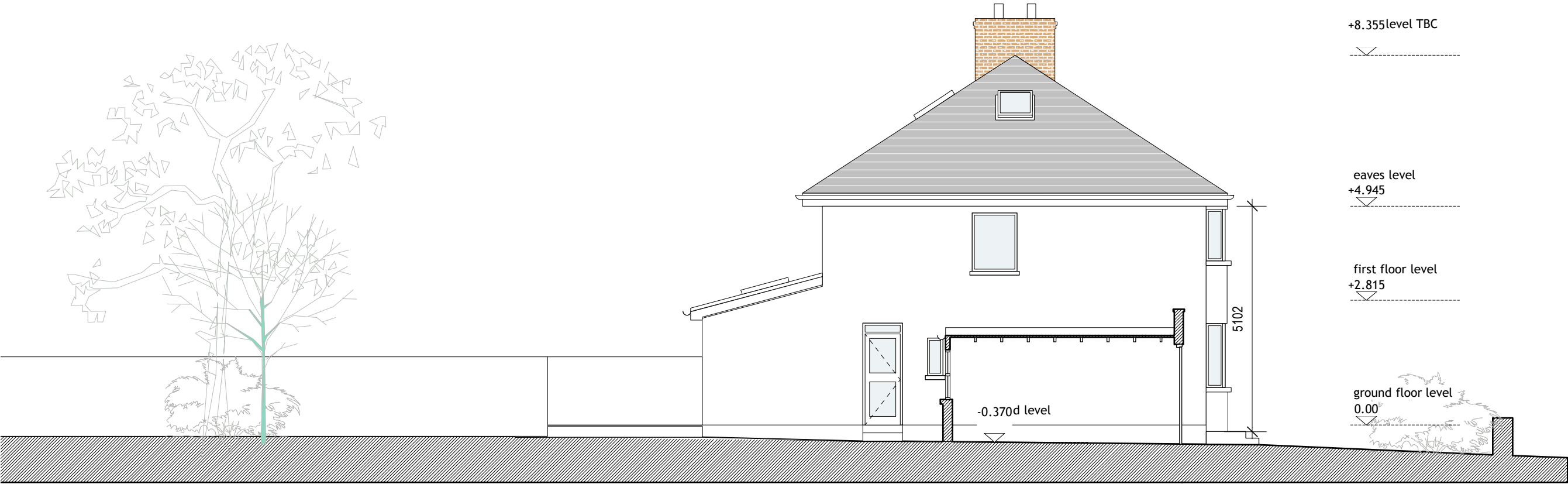
1 Existing Section/ Side Elevation Scale: 1:100 @ A4/A3

Do not scale. Use figured dimensions only. All dimensions must be checked on site and any discrepancies between site and figured dimensions to be brought immediately to the architect before pricing or site commencement. © This drawing is copyright & may not be used without prior permission.