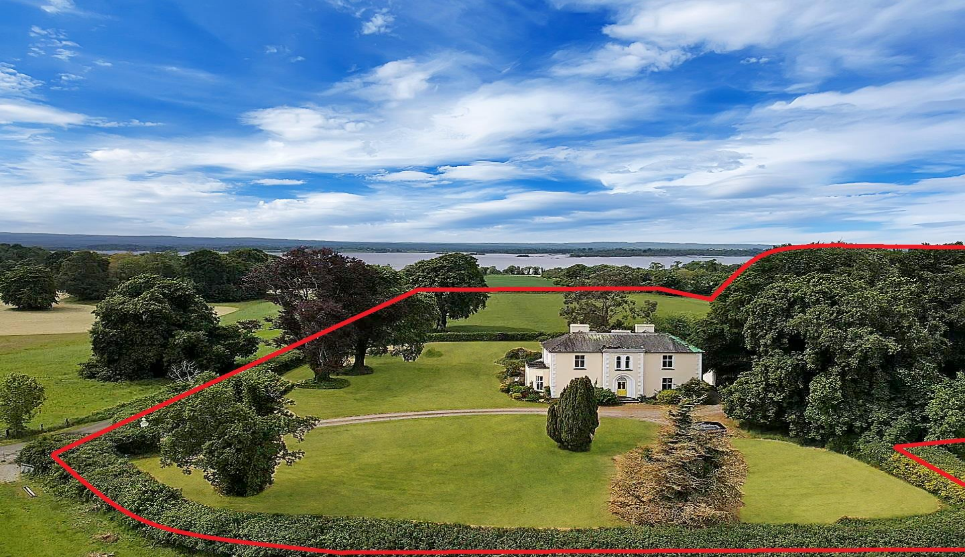
Brookfield House, Coolbawn, Nenagh, Co. Tipperary, E45EY67.