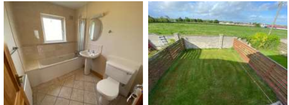
Main Bathroom and View from Bedroom 2

Landing 14' x 6'07 (4.3 x 1.9) Timber flooring, hotpress; access to attic.