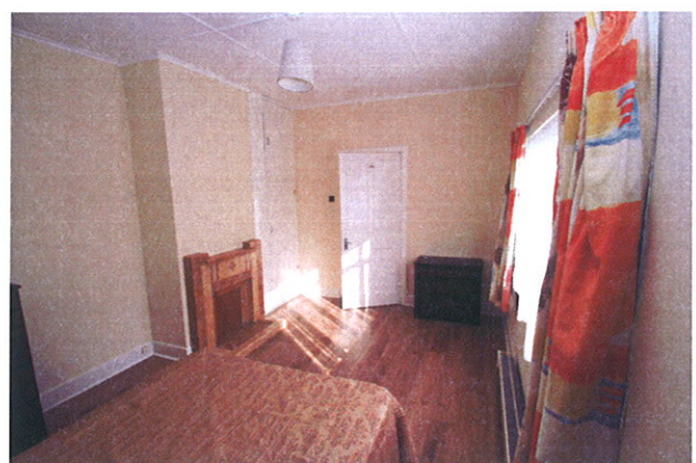
GROUND FLOOR 770 sq.ft. (71.5 sq.m.) approx.