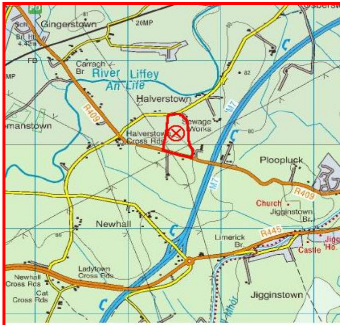
Location of lands in red