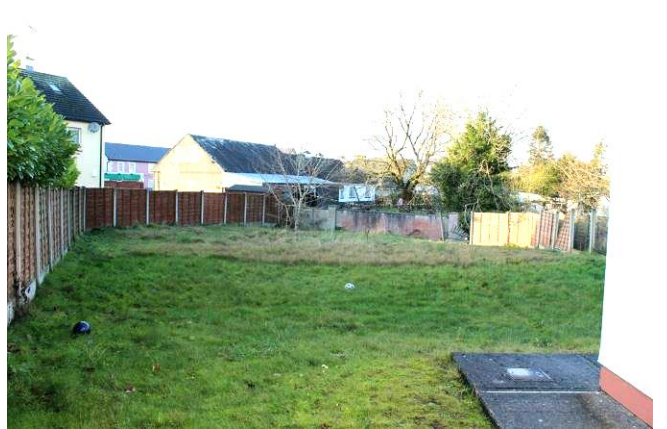
GARDEN TO REAR