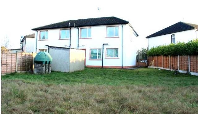
REAR VIEW OF RESIDENCE