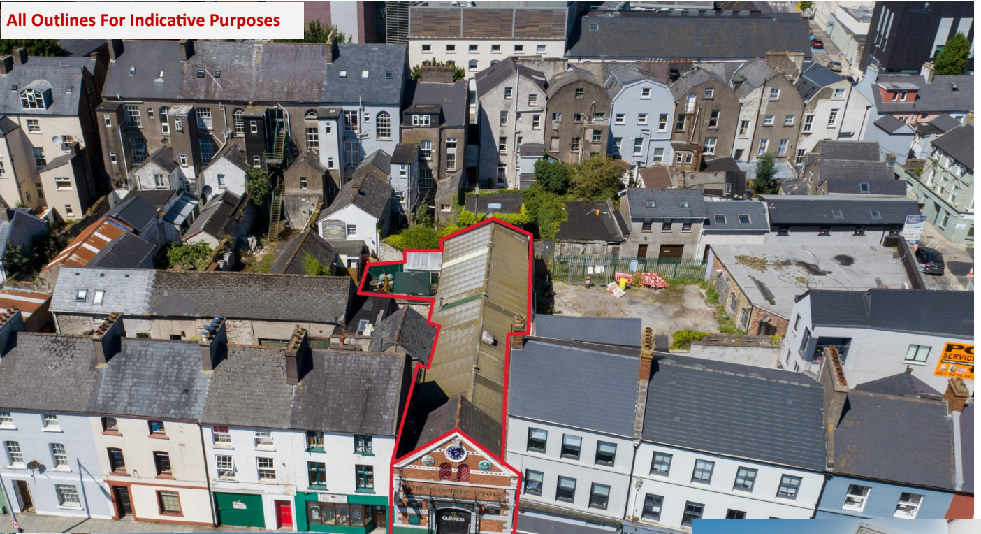
All Outlines For Indicative Purposes