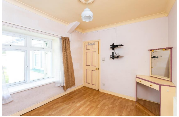
1ST FLOOR 657 sq.ft. (61.0 sq.m.) approx.