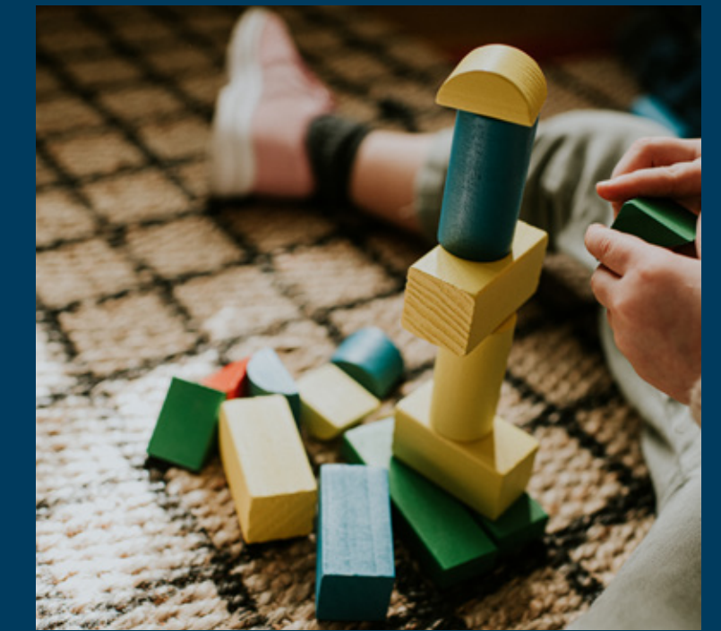
Linden Demense Crèche, Maynooth, Co Kildare

The ground floor crèche extends to approx. 5,673 sq ft.