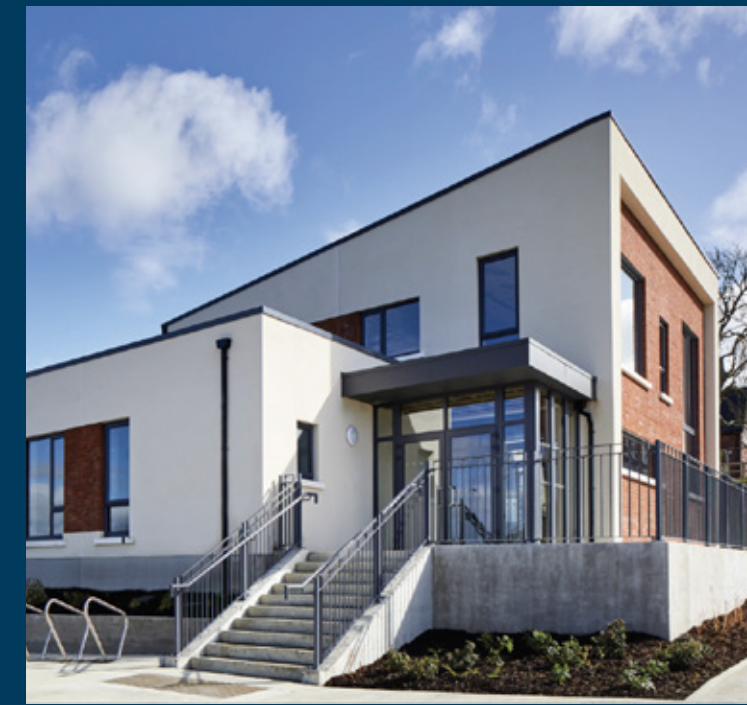
Oak Park Crèche, Naas, Co. Kildare

The unit benefits from an extensive play area of 1,130 sq ft.