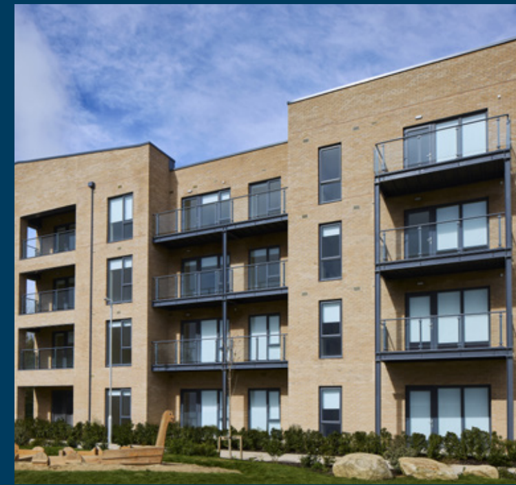
Harpur Lane Crèche, Leixlip, Co. Kildare

The unit benefits from an extensive play area of 1,550 sq ft.