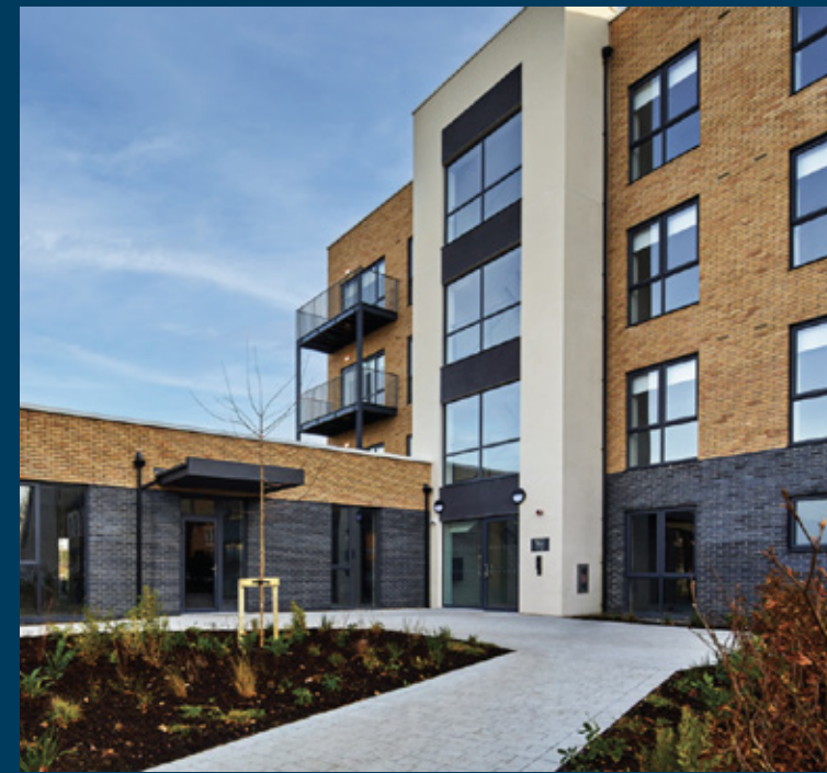
Elsmore Crèche, Naas, Co. Kildare

The unit benefits from an extensive play area of 2,734 sq ft and is laid out over two floors.