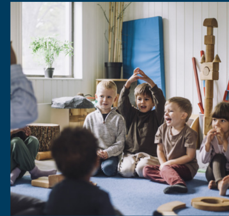
Parkside Crèche, Balgriffin, Co. Dublin

The unit benefits from an extensive play area of 2,271 sq ft and is laid out over two floors