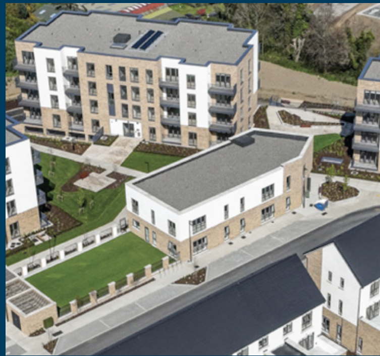
Archers Wood Crèche, Delgany, Co. Wicklow

The crèche consists of a large detached unit extending to approx. 6,631 sq ft.