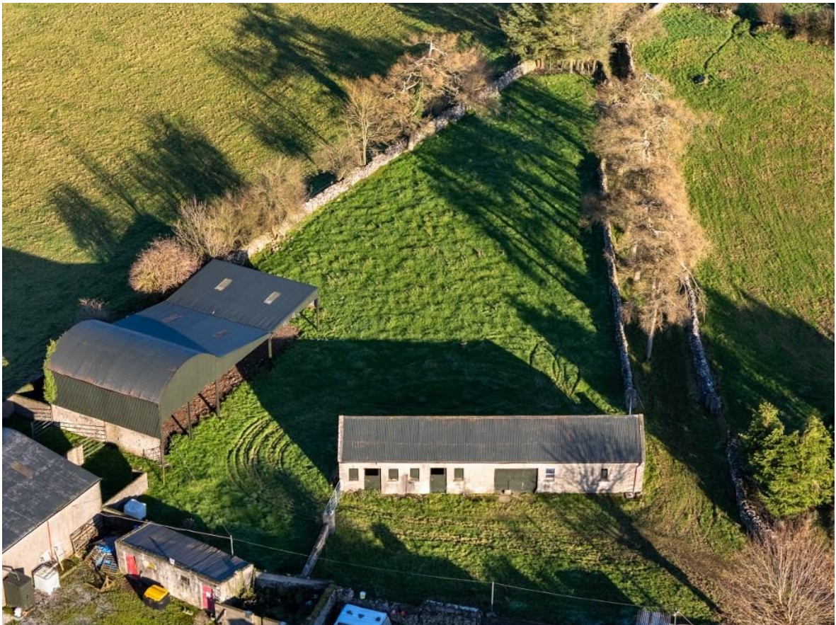
Residence on C. 4.18 Acres, Torpan More, Ballyforan, Co. Roscommon. H53 WP04