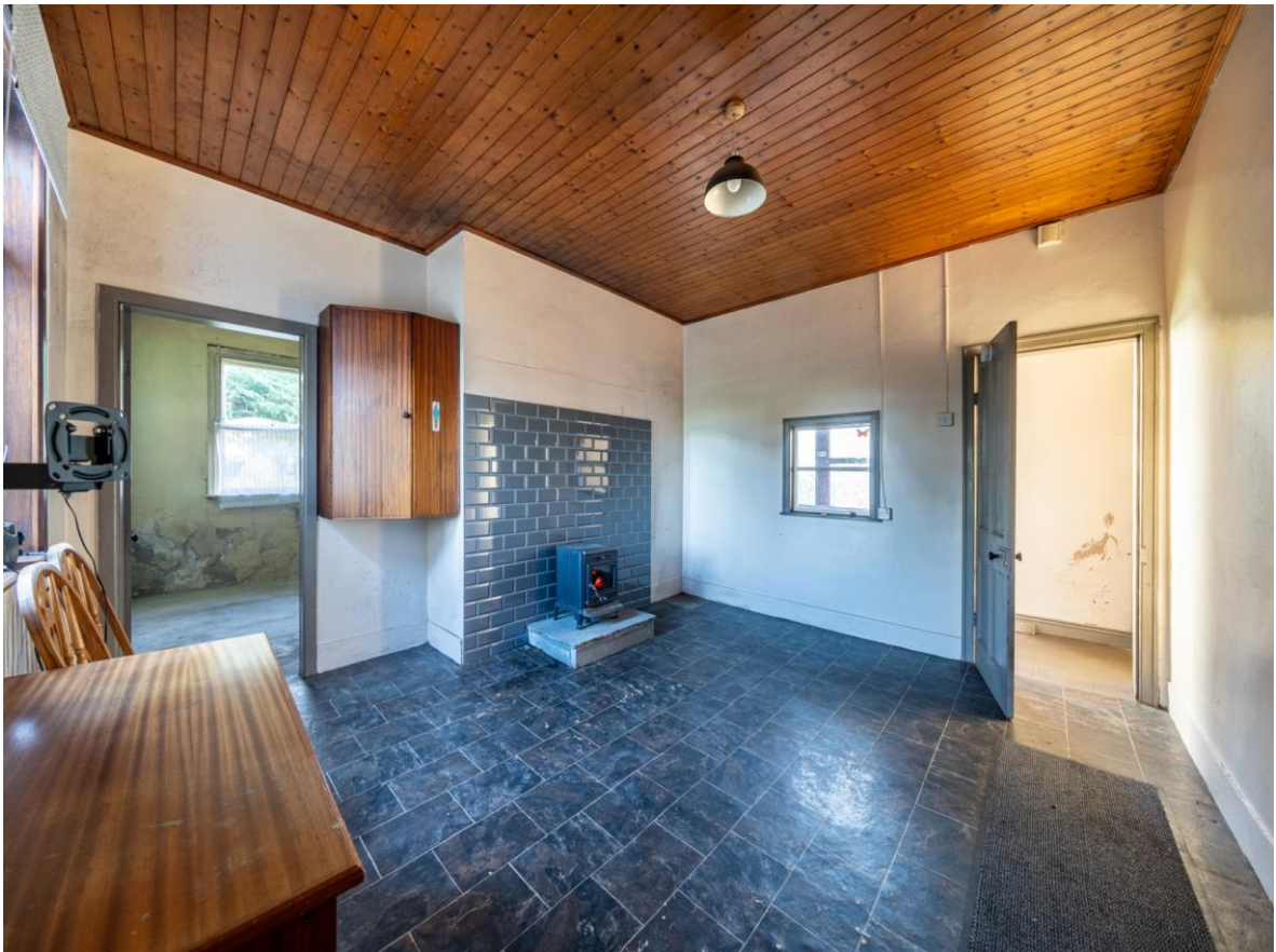
Residence on C. 4.18 Acres, Torpan More, Ballyforan, Co. Roscommon. H53 WP04