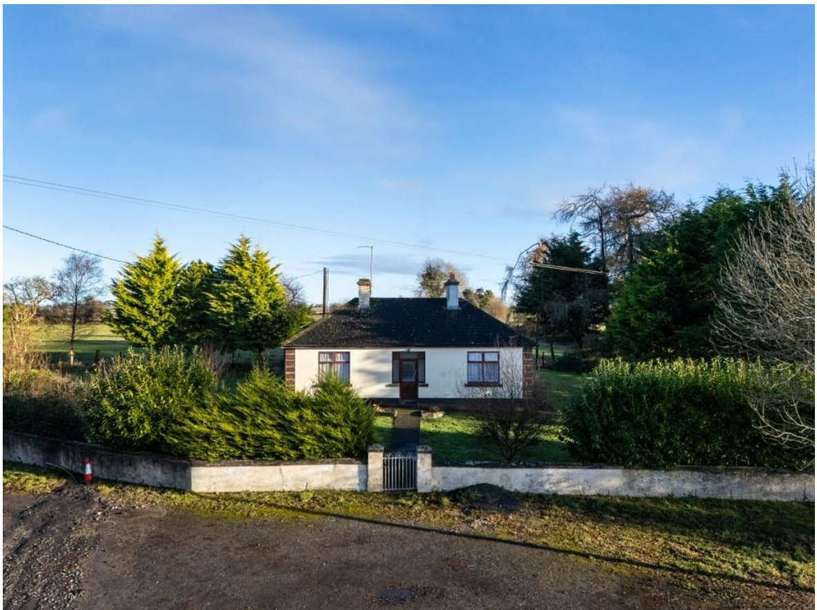
Residence on C. 4.18 Acres, Torpan More, Ballyforan, Co. Roscommon. H53 WP04