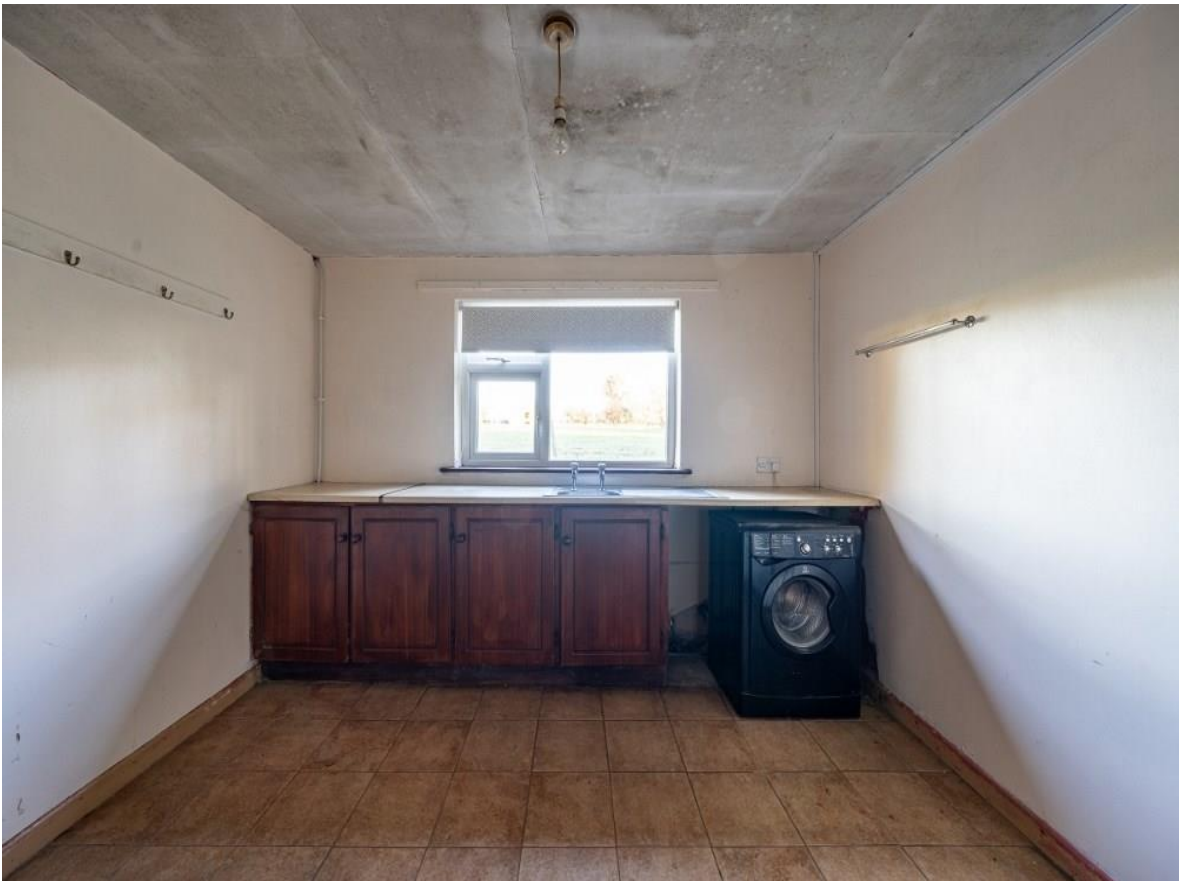
Residence on C. 4.18 Acres, Torpan More, Ballyforan, Co. Roscommon. H53 WP04