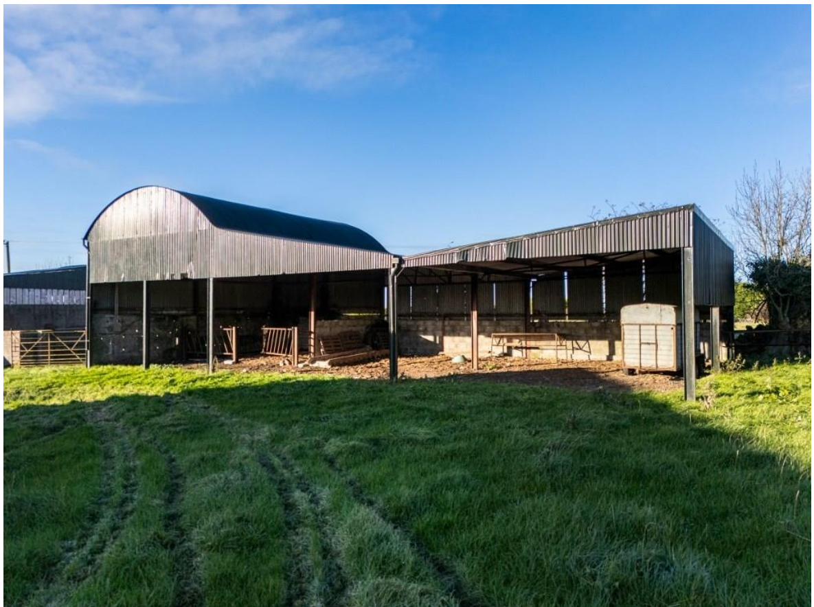
Residence on C. 4.18 Acres, Torpan More, Ballyforan, Co. Roscommon. H53 WP04