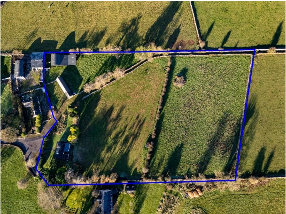
Residence on C. 4.18 Acres, Torpan More, Ballyforan, Co. Roscommon. H53 WP04