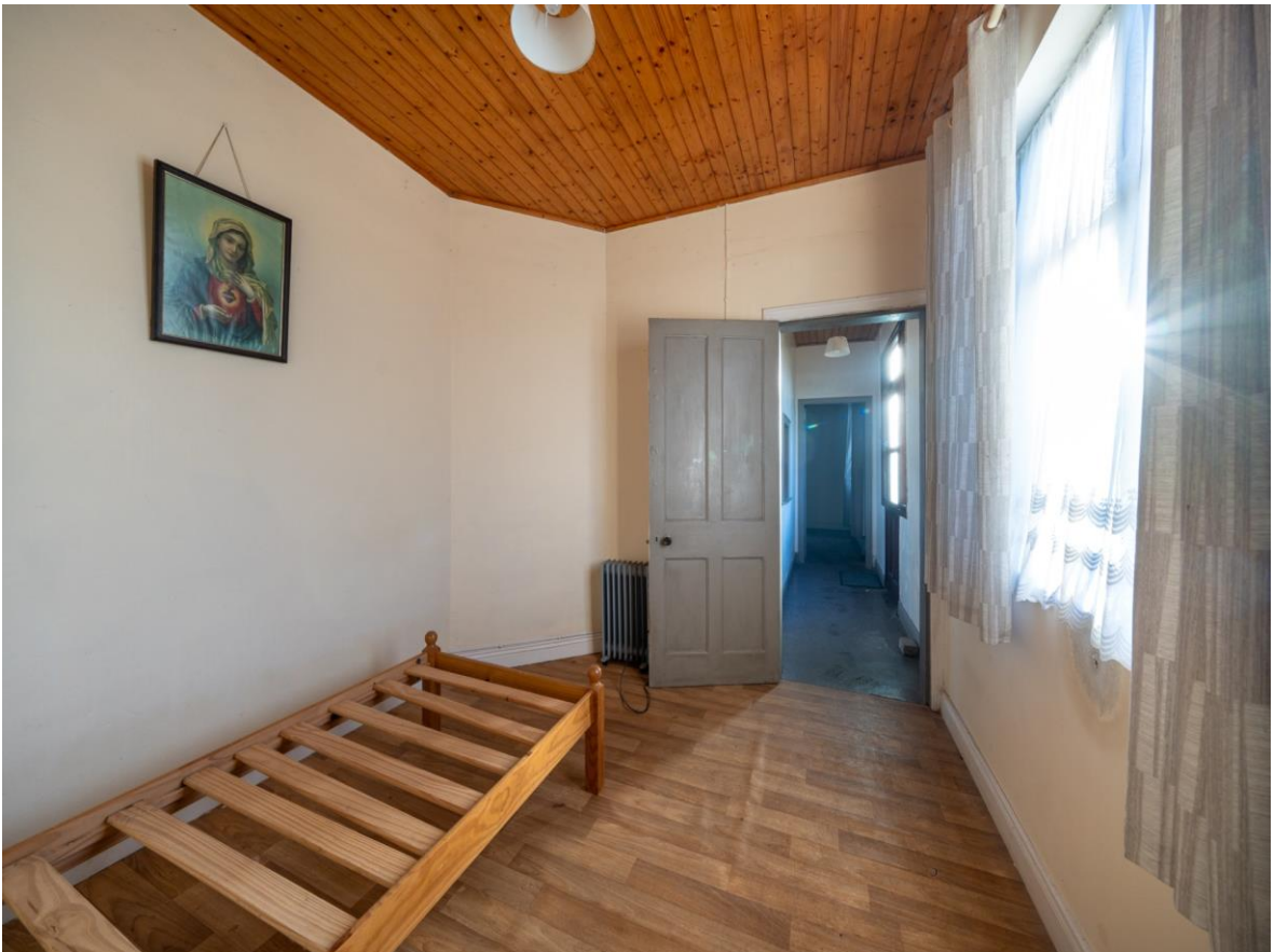
Residence on C. 4.18 Acres, Torpan More, Ballyforan, Co. Roscommon. H53 WP04