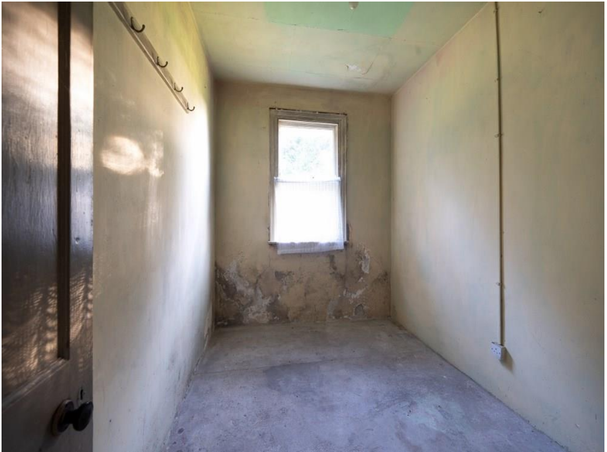
Residence on C. 4.18 Acres, Torpan More, Ballyforan, Co. Roscommon. H53 WP04