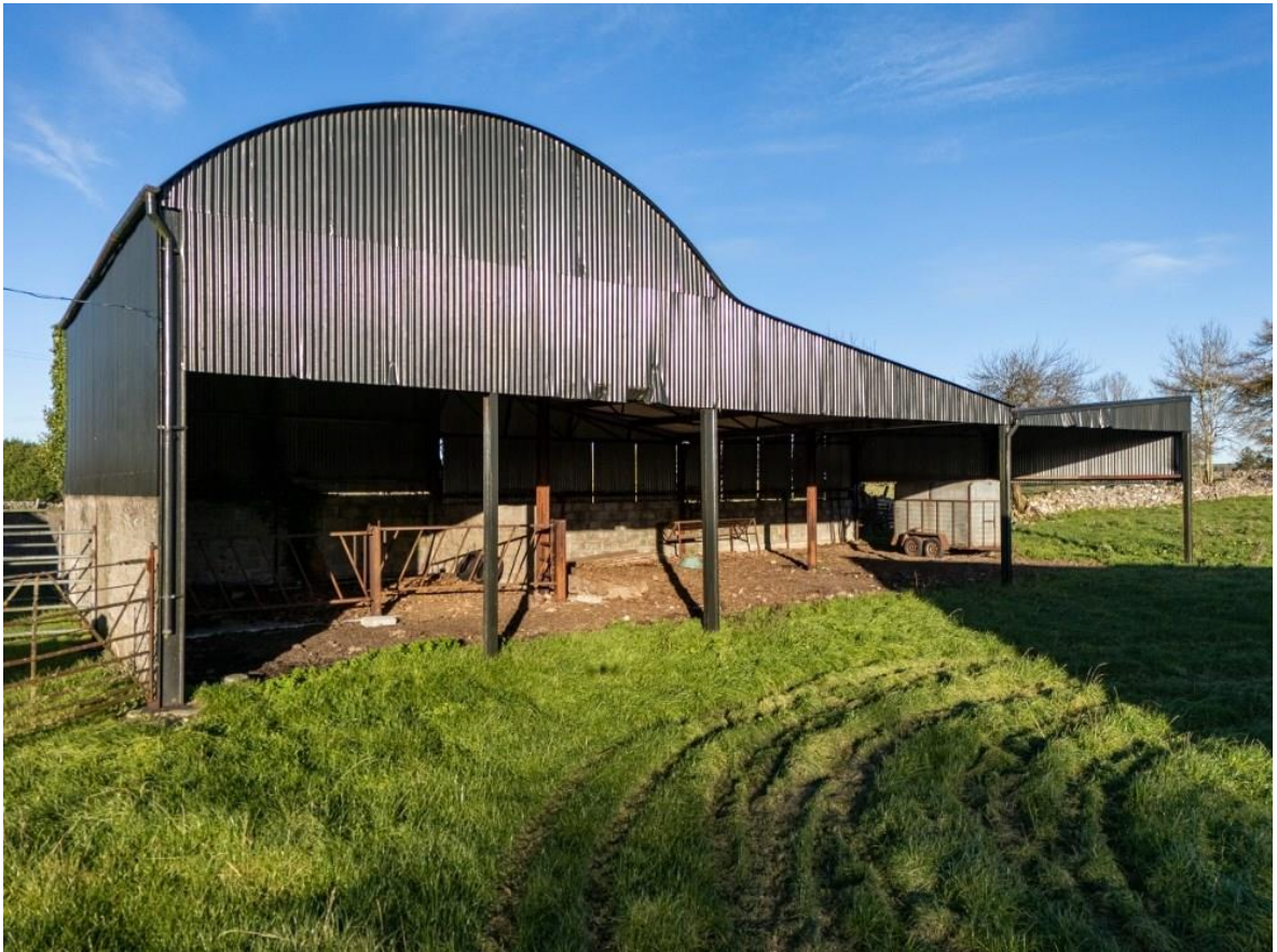
Residence on C. 4.18 Acres, Torpan More, Ballyforan, Co. Roscommon. H53 WP04