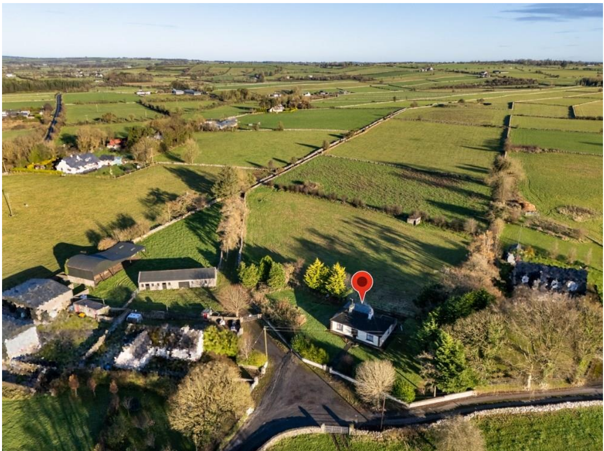
Residence on C. 4.18 Acres, Torpan More, Ballyforan, Co. Roscommon. H53 WP04