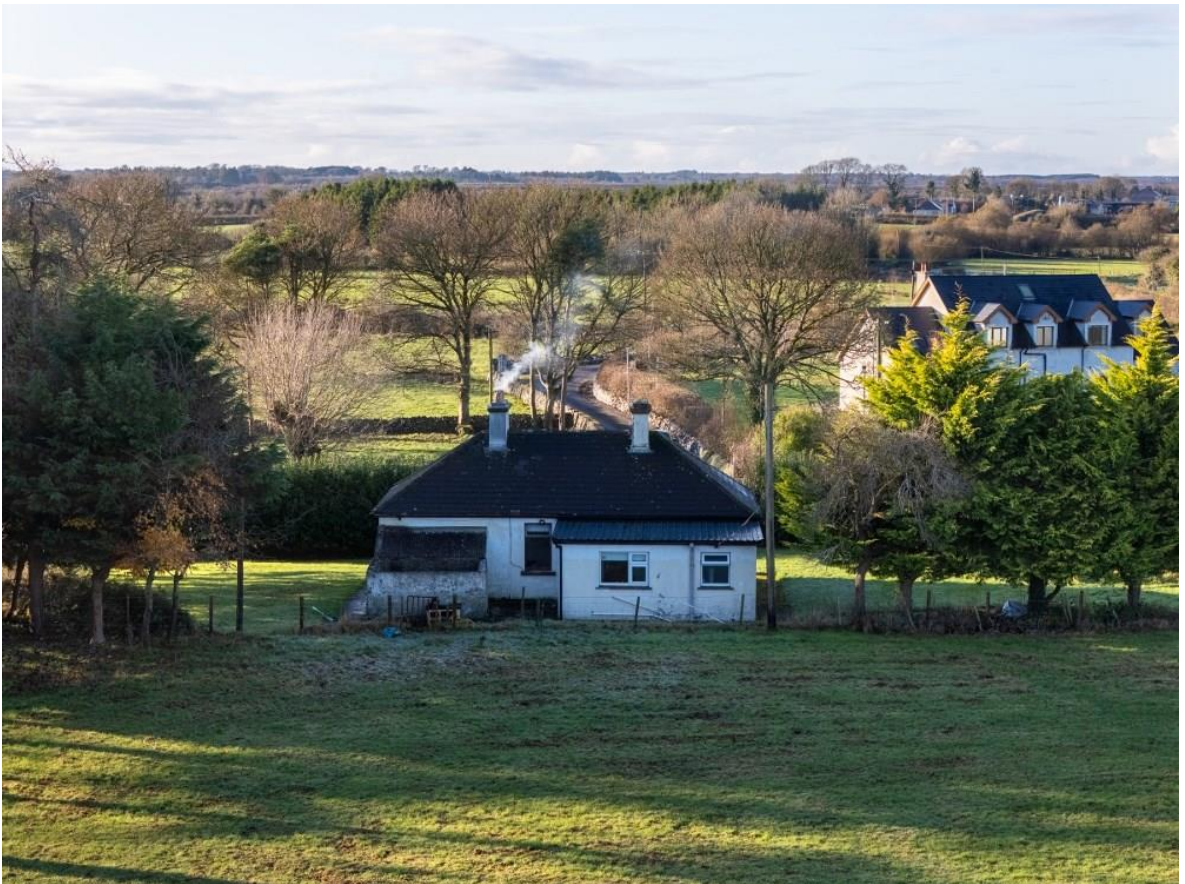
Residence on C. 4.18 Acres, Torpan More, Ballyforan, Co. Roscommon. H53 WP04