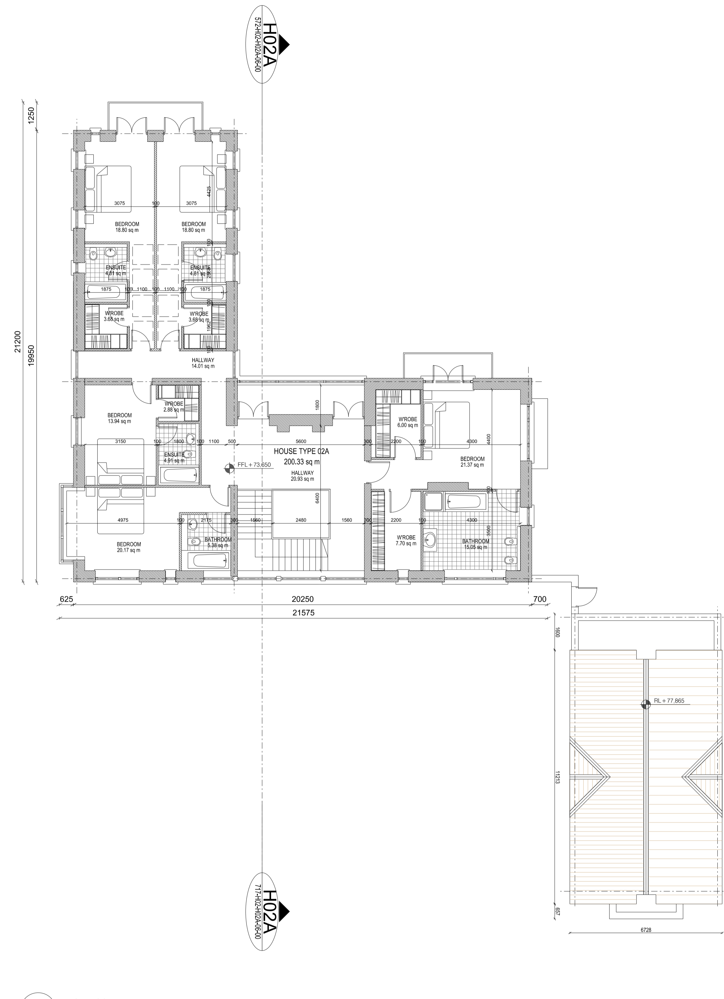
2 FIRST FLOOR PLAN 1:100