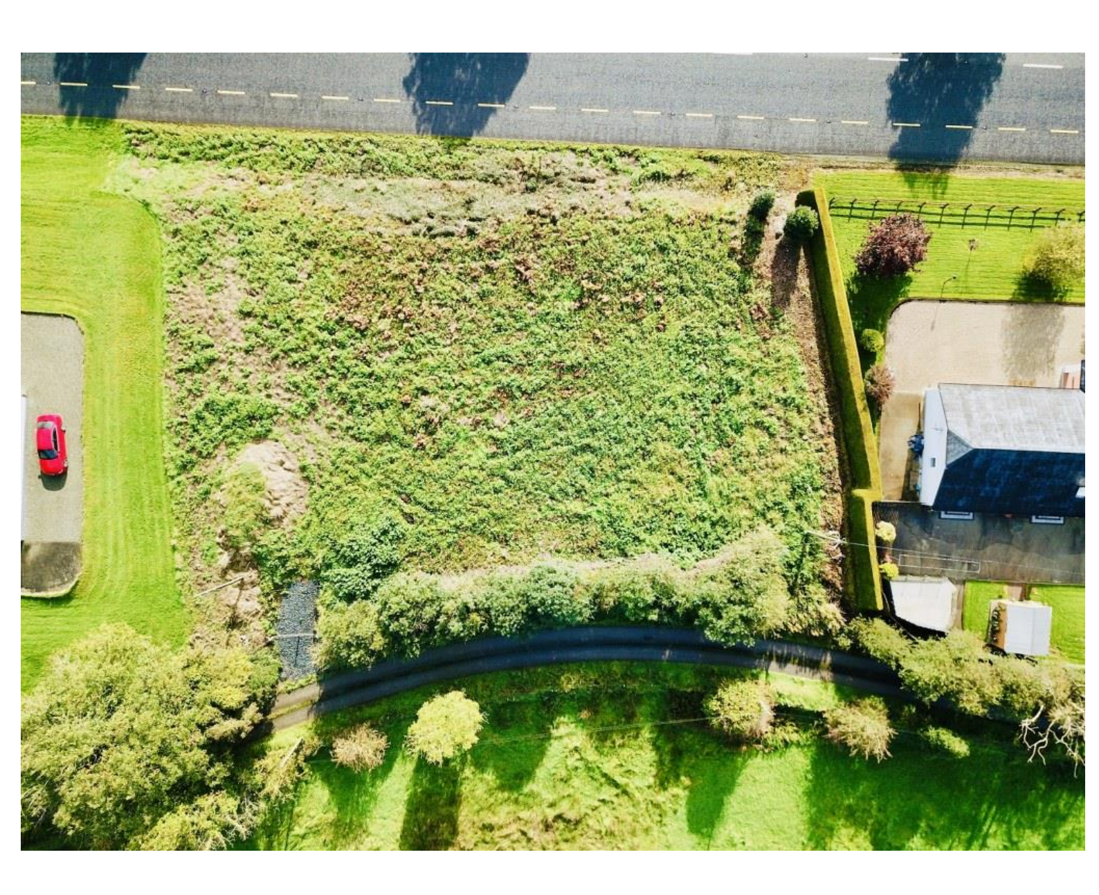
0.15 Ha (0.37 Acres), Castleforward, Newtowncunningham, Co Donegal