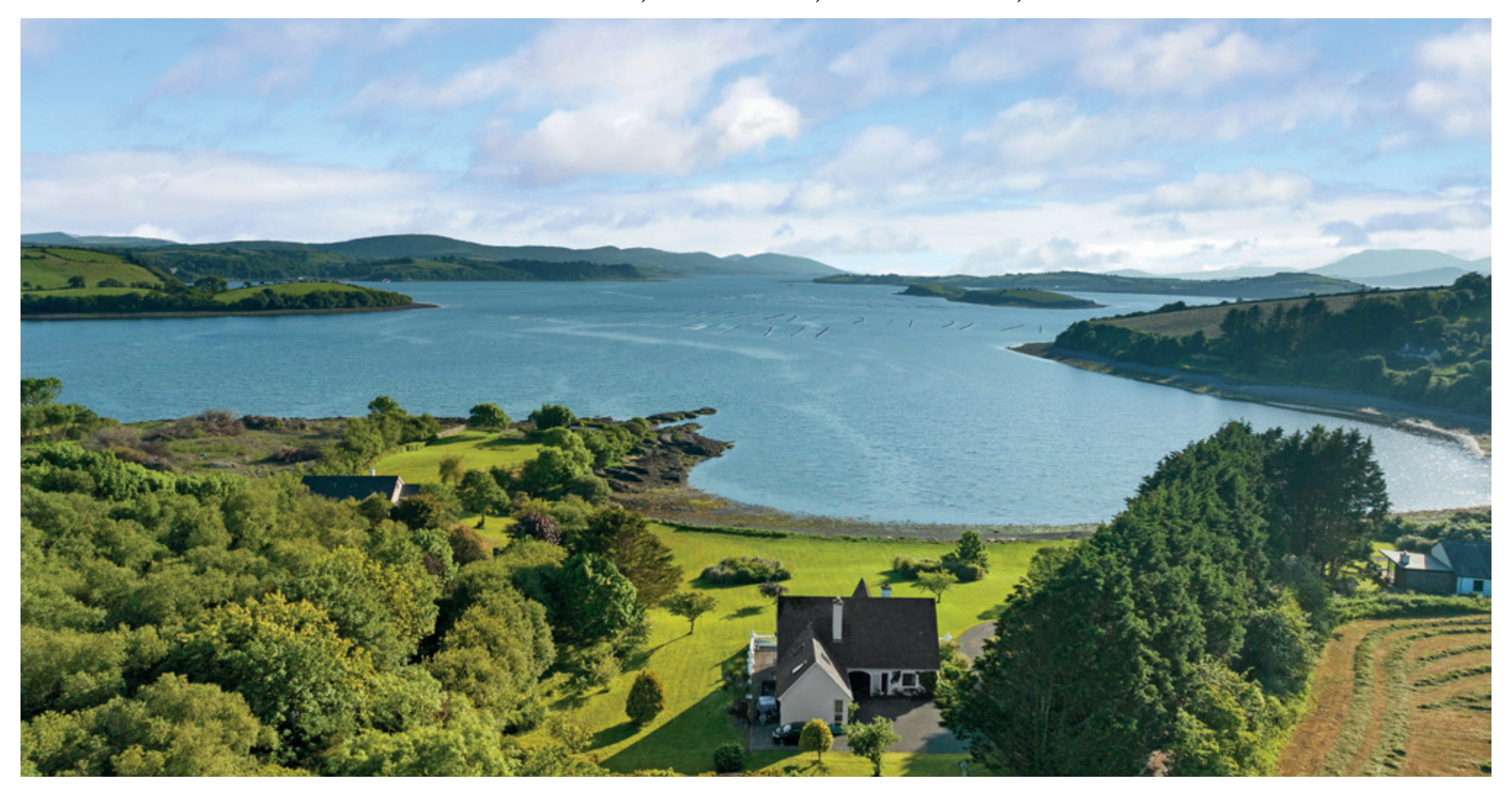
SECLUDED BEACH HOUSE WITH EXTRAORDINARY COASTAL VIEWS

FIVE BEDROOMED HOUSE WITH PRIVATE BEACH ACCESS, SLIP AND MOORING ADJACENT TO BANTRY GOLF COURSE.