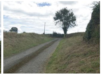
Viewing By Appointment Only