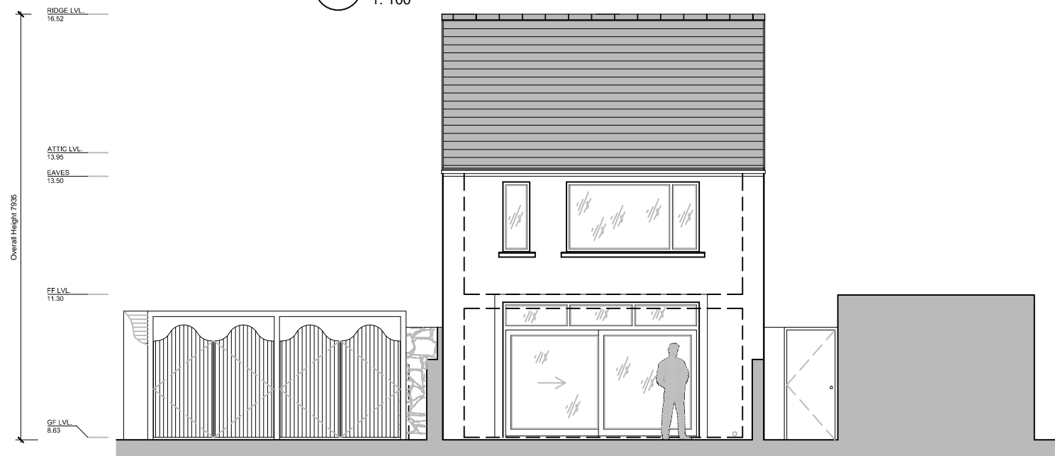
02 Proposed Rear Elevation 1: 100