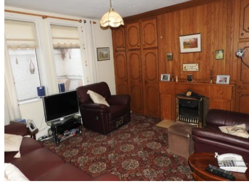
Sitting Room 11'09 \times 11'09 \ (3.38 \times 3.83) Carpet flooring, open fireplace with timber surround and granite heart. Hotpress built in to one side.