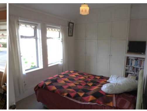
Bedroom 3 9'05 x 8'05 (2.75 x 2.45) Carpet flooring, built in wardrobe – again situated to the front.

Bathroom 6'02 x 6'02 (1.83 x 1.83) WHB, WC and Shower with power shower. Vinyl flooring, walls fully tiled.