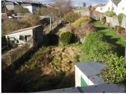
Views front and rear from first floor bedrooms

Kindly note that any negotiations respecting the above property are conducted through us. We do not hold ourselves responsible in any way for inaccuracy, but will take every care in preparing particulars. All offers are subject to the property being unsold, let or withdrawn. The above may be seen by appointment only. Any reasonable offer will be submitted to the owner for consideration. If the property does not interest you, kindly advise us as to