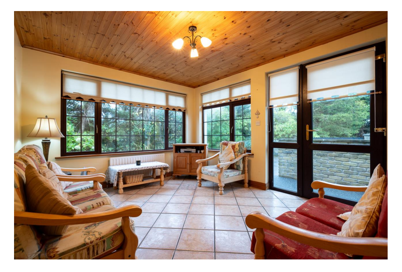
Directions Y25 EE04