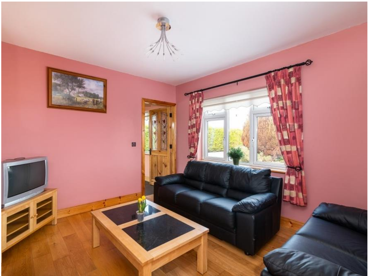
Killeglan, Taughmaconnell, H53 N563