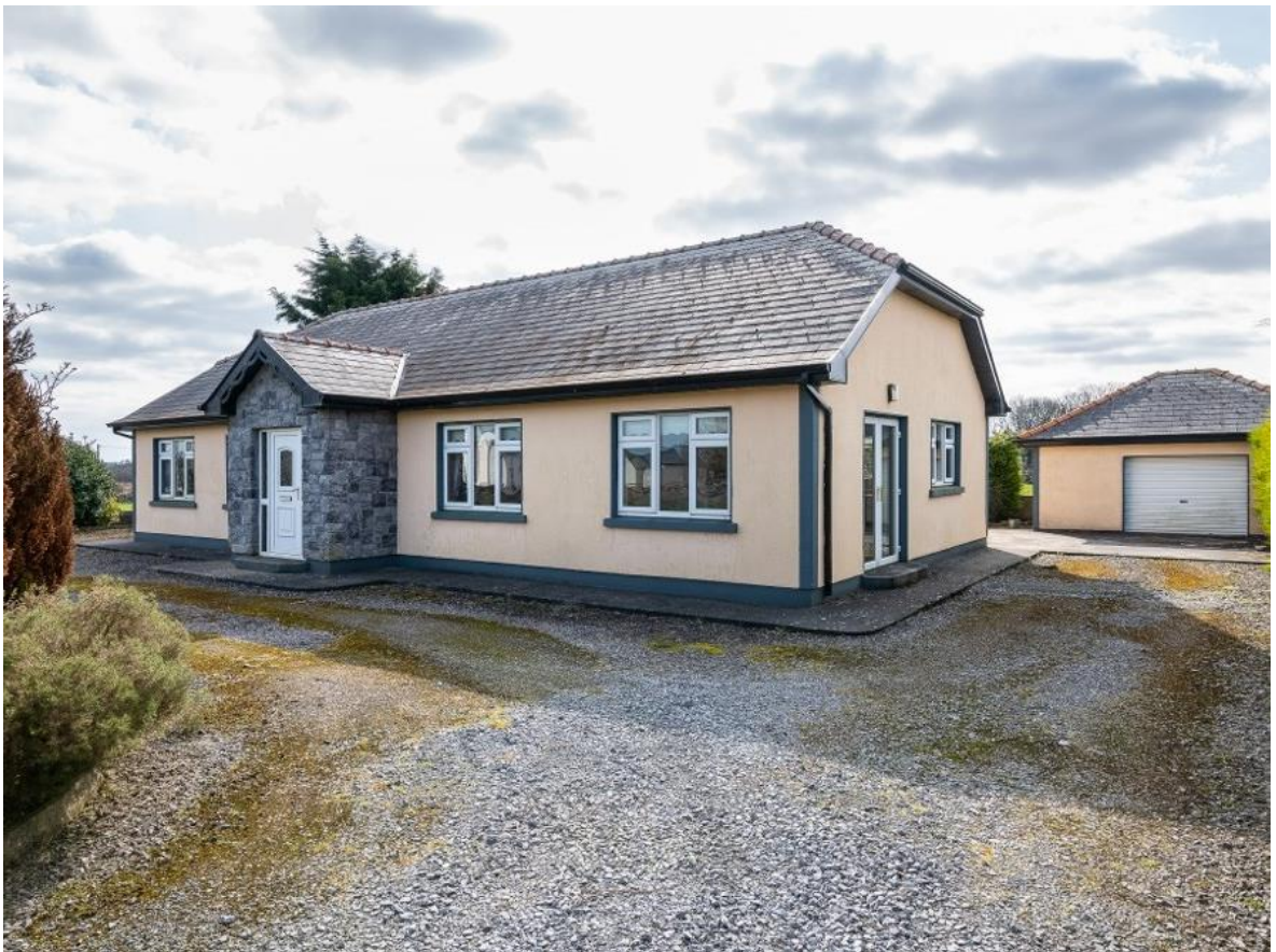
Killeglan, Taughmaconnell, H53 N563