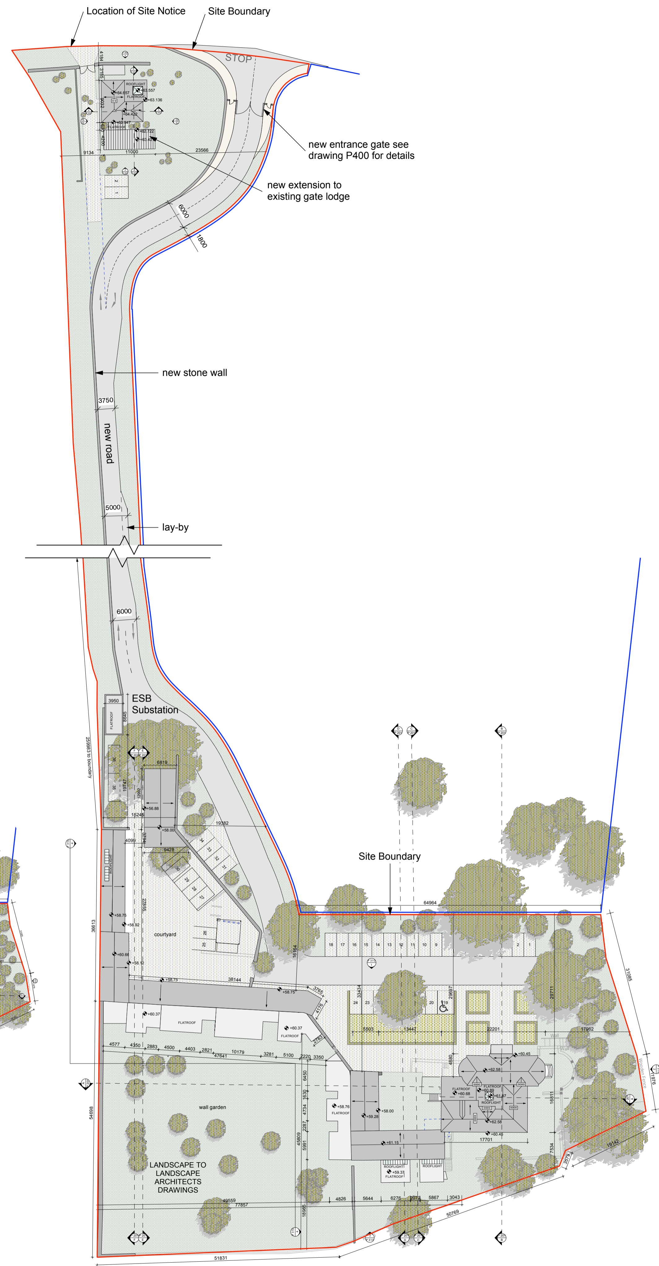
3 SITE LAYOUT PLAN SCALE 1:500

Do not scale. Use figured dimensions only. All dimensions to be checked on site. Any discrepancies between site and figured dimensions to be brought immediately to the architect's attention. Digital copies cannot be guaranteed. Only information in hard copy can be relied upon for conformity and accuracy. © This drawing is copyright. OS maps are reproduced under Ordnance Survey Ireland Licence No AR 0031108. © Ordnance Survey Ireland and Government of Ireland.