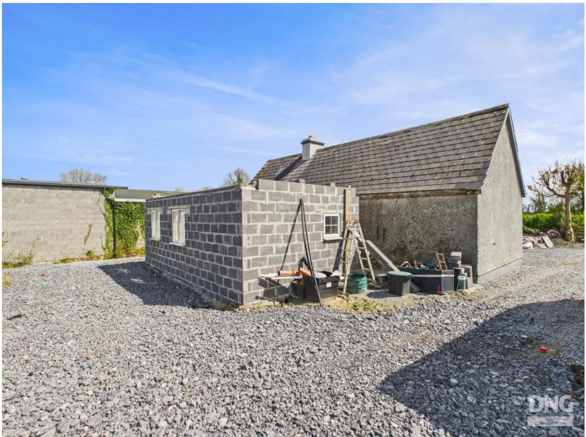
Rushstown, Newbridge, County Galway