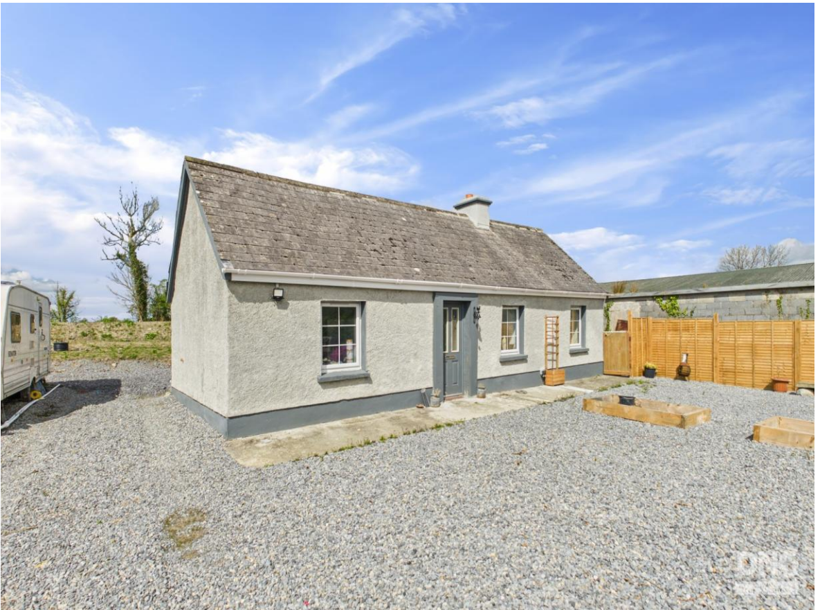
Rushestown, Newbridge, County Galway