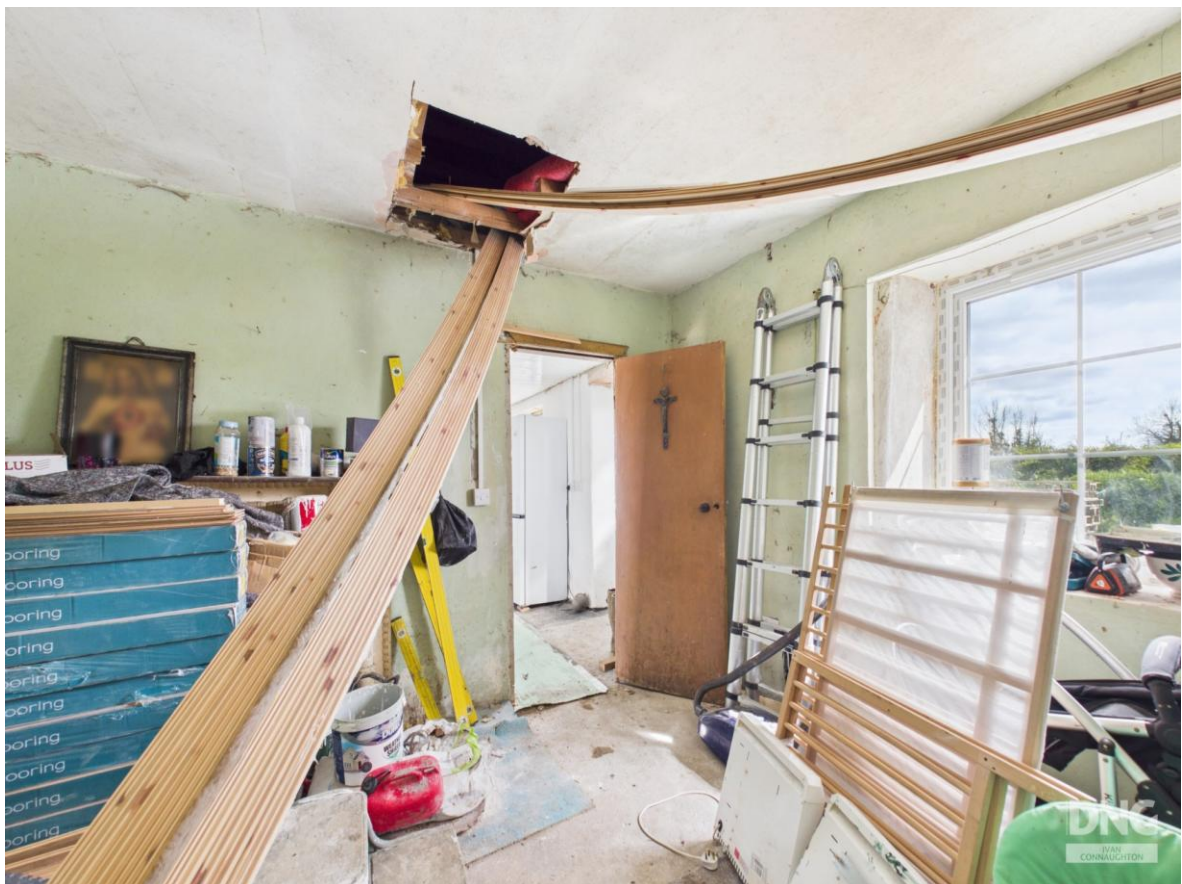
Rushstown, Newbridge, County Galway