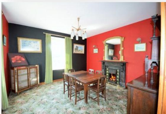
SITTING / DINING ROOM

Services: Private well, septic tank, oil fired central heating, double glazing and broadband is available.