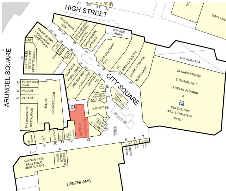
For Identification Purposes Only.