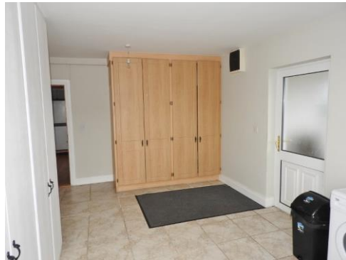
Living Area & Utility Room

Utility Room 18'04 x 12'06 (5.49 x 3.67)