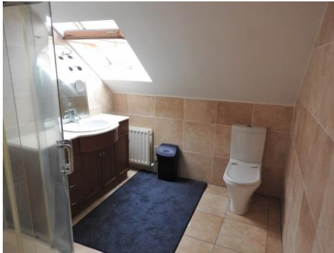
Large Bedroom with Built-in Wardrobes & Ensuite Bathroom on the First Floor

Bedroom 6 14'01 x 18'09 (4.27 x 5.50) Carpet flooring