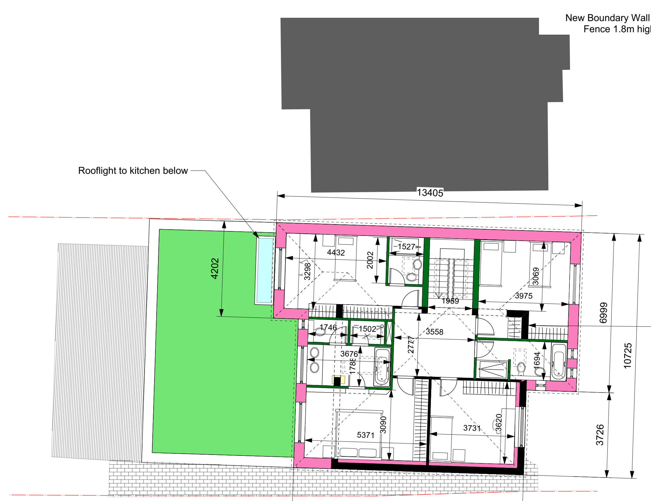
2 FIRST FLOOR PLAN Scale: 1:100