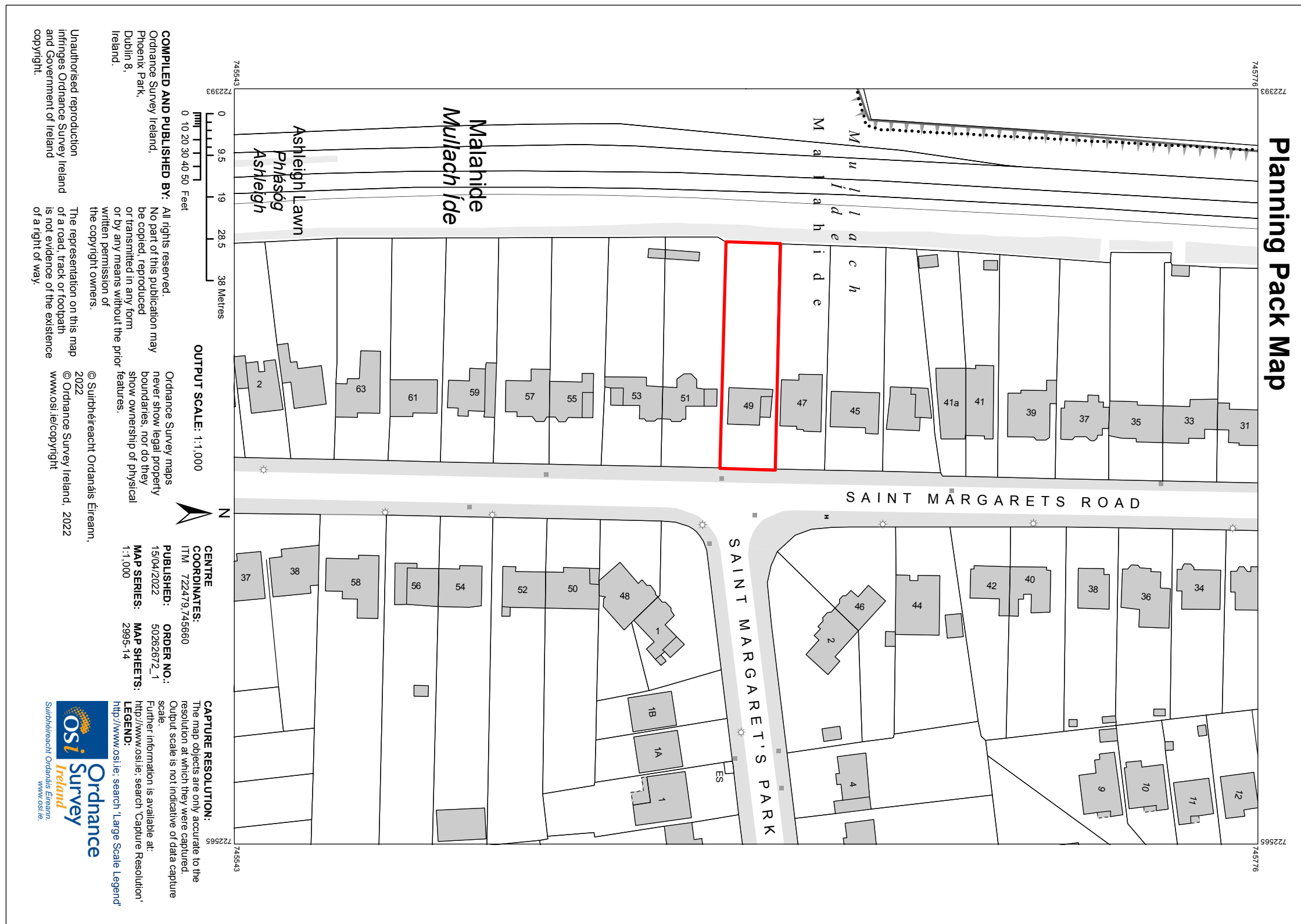
1 SITE LOCATION MAP Scale: 1/1000