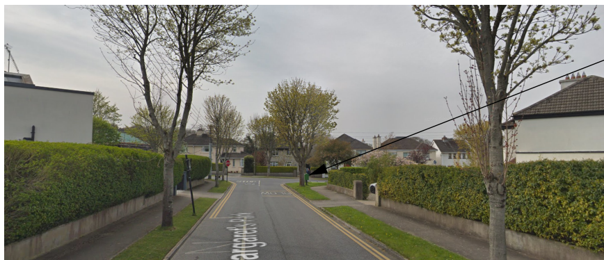
Framed view of Street from St Margaret's Park