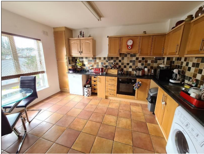
Kitchen / Dining