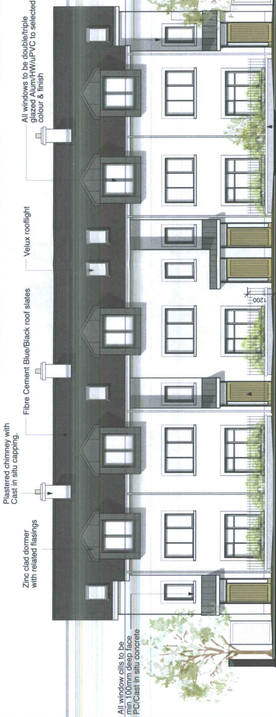
House No. 1 House No. 2 House No. 3 House No. 4 House No. 5 North East ( Front ) Elevation