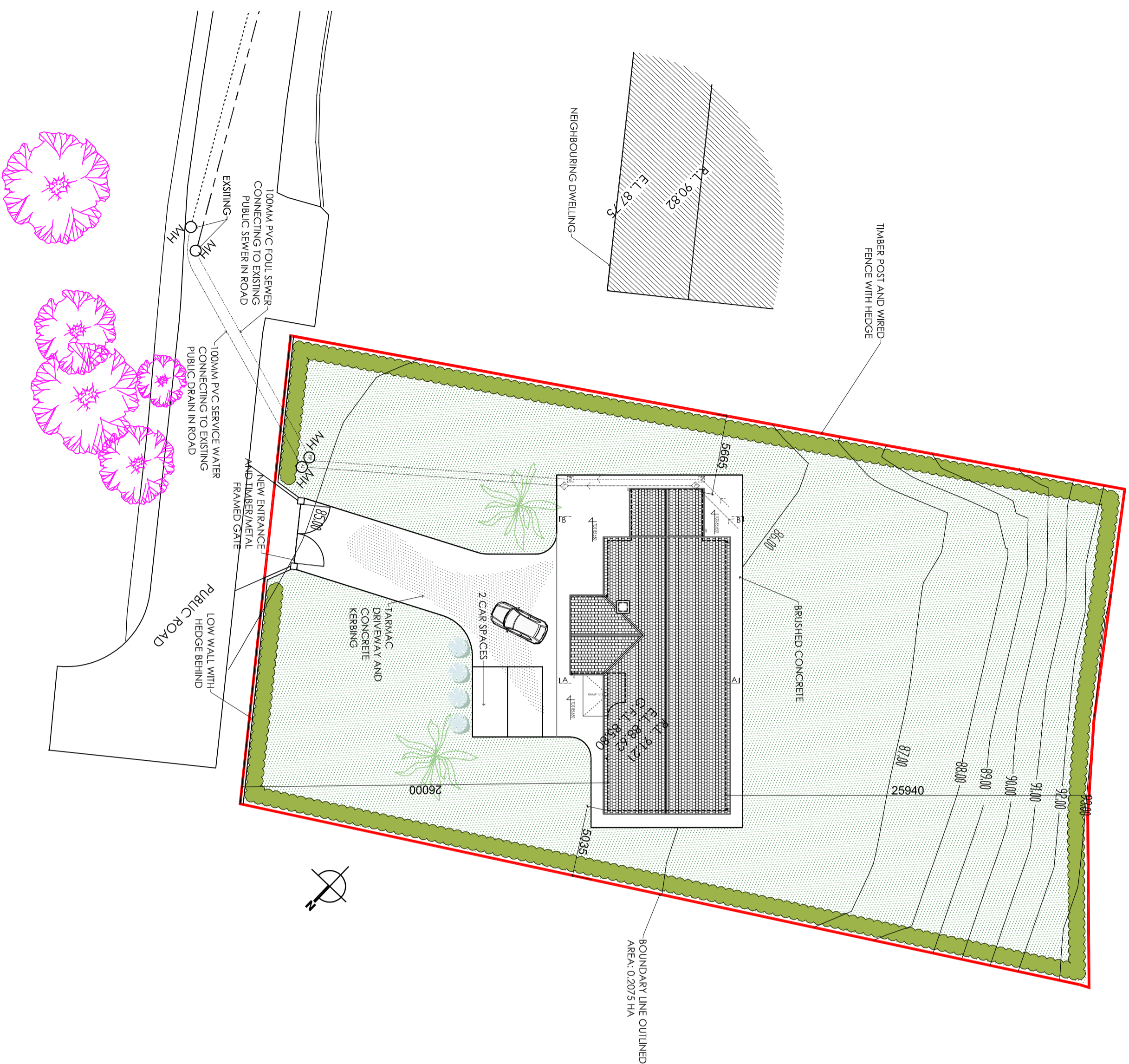
SITE PLAN SCALE 1:250

Note: Refer to Engineers' drawings for foundation, steelwork, woodwork structure and retaining wall details and specifications.