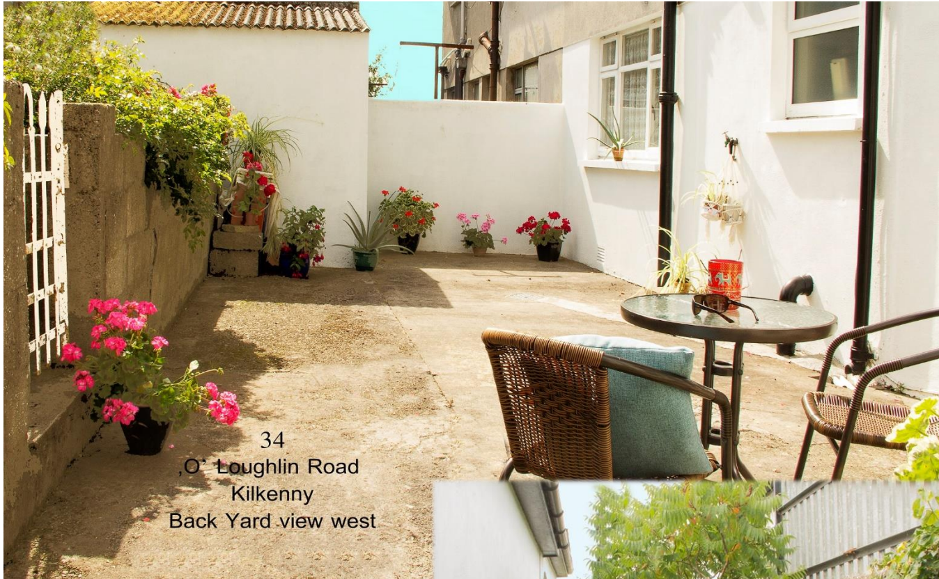
34 O'Loughlin Road Kilkenny Back Yard view west