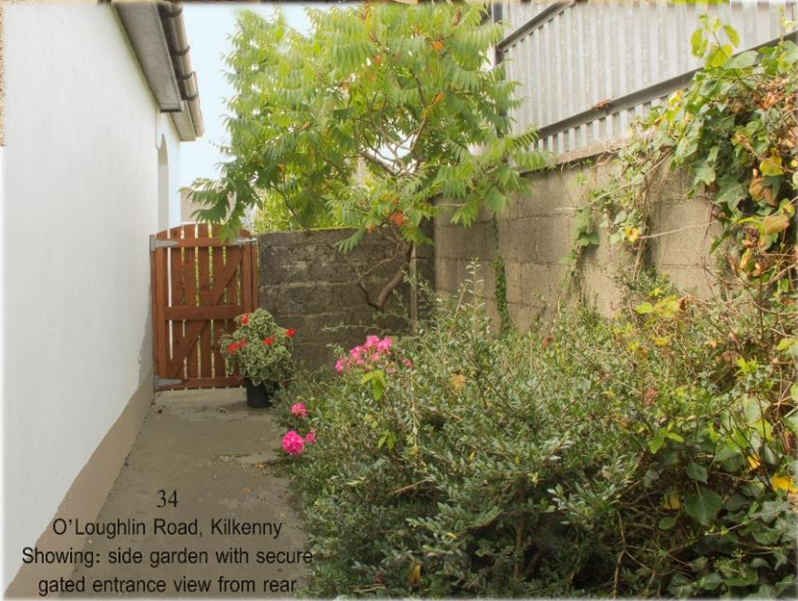
34 O'Loughlin Road, Kilkenny Showing: side garden with secure gated entrance view from rear

Portaoise Office: 9 Market Square, Portlaoise, R32 YK6H T: 057 860 6980 M: 087 2226833 E: tbuggy@propertypartners.ie www.propertypartners.ie