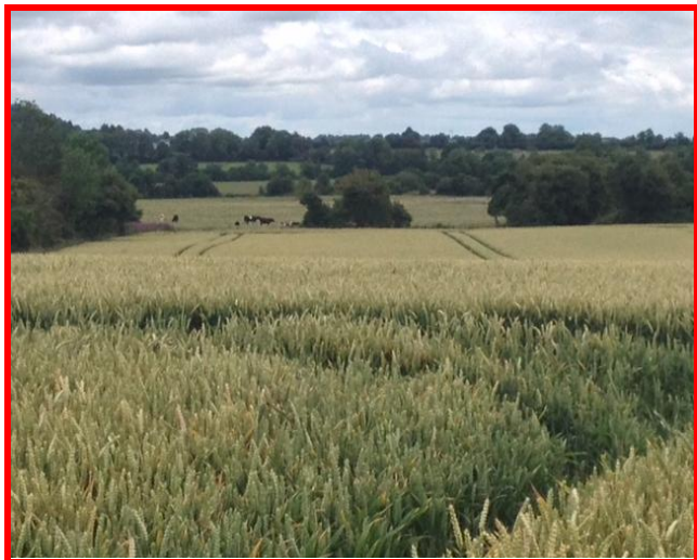
Photo of lands